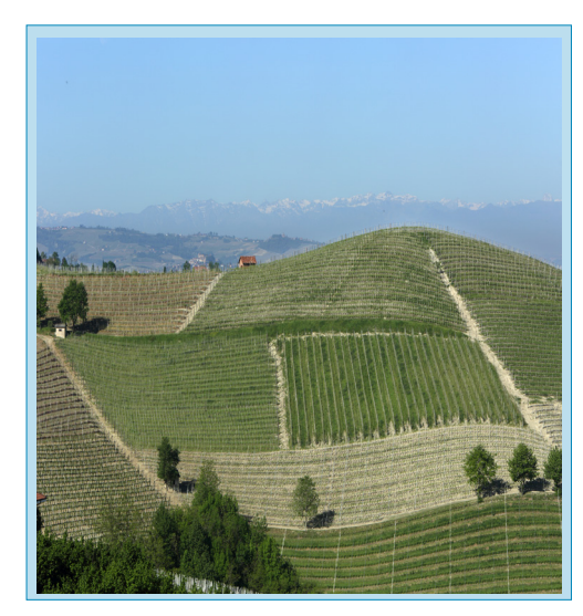
Castello di Verduno's Faset parcel in Barbaresco

Barolo due to its unique vineyard 'signature'.