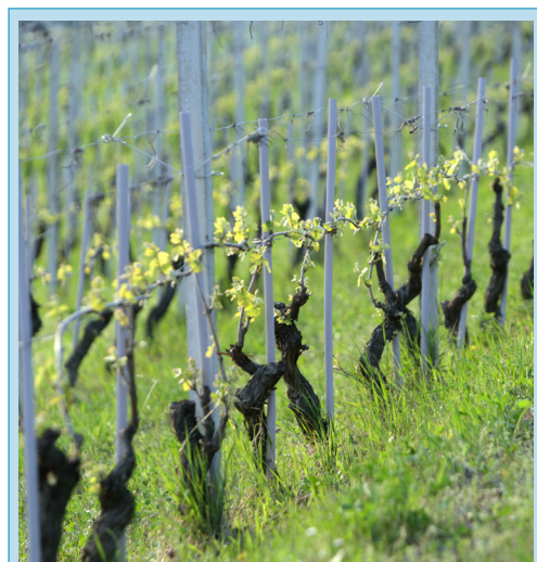
Vines in the Rio Sordo cru below the winery

L on Barbaresco from both the clay soils of the vineyard Rio Sordo, and also from the calcareous soils of the Tre Stelle vineyard. These steep hillside vineyards are all worked by hand. Grapes are harvested also by hand, de-stemmed, and then fermented with natural yeasts.