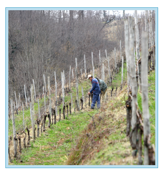
Vineyard workers in the Collis Breclemae Cru

are deep, as there is evidence that grape cultivation in this area predates the Roman empire. The climate here is not dissimilar from that around Alba where the nebbiolo grape reaches its apogee in the wines of Barbaresco and Barolo, with warm summers and foggy autumns allowing nebbiolo to again produce lovely wines. Located so close to the alpine peak of the Monte Rosa, which is the second highest mountain in all of Europe, the soils of Ghemme are not rich by any stretch of the imagination, and the corresponding wines are elegant and mineral-driven in style.