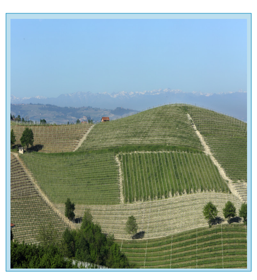
Castello di Verduno's Faset parcel in Barbaresco

The crown jewels of their range, not surprisingly, are the Barolo Monvigliero Riserva and the Barbaresco Rabaja. The Monvigliero, sourced from a parcel at the crest of the Monvigliero hill is dense and structured with floral and spicy notes which are typical of the cru. The soil there is called Marne di Sant'Agata - it is made up of 55% clay, 30% sand and 15% limestone. Castello di Verduno also has two parcels in the fine cru of Rabaja, one planted in 1974 and one planted in 1990, for a total of just 1.23 hectares. Their Rabaja is focused and