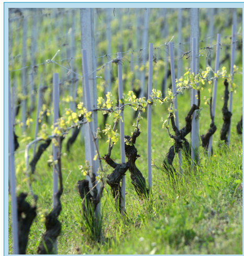
Vines in the Rio Sordo cru below the winery

L on Barbaresco from both the clay soils of the vineyard Rio Sordo, and also from the calcareous soils of the Tre Stelle vineyard. These steep hillside vineyards are all worked by hand. Grapes are harvested also by hand, de-stemmed, and then fermented with