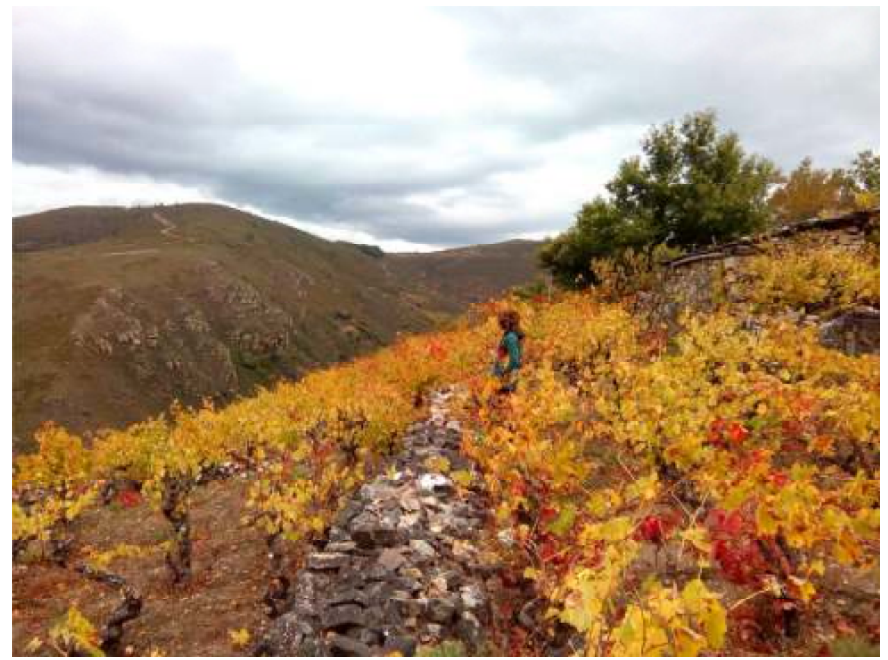
October's gold and russet tones in one of Ribeira Sacra's sub-regions, Quiroga-Bibei.

Part Two of my annual coverage of the beautiful wines of Spain has been delayed a bit more than I anticipated when I first finished up Part One back in June of last year. I had imagined working on the second installment of my coverage of Spain in September and October of last year, but the sheer volume of samples piling up in my cellar over the last quarter of 2018 had me falling behind on my tasting and this article kept getting shuffled to the "next issue" as my pace of writing notes on samples could not keep up with the number of bottles coming in. On one hand, this was unfortunate, as some of the superb wines featured below have now been in the market for a few months and may have already sold through the pipeline, but the delay also allowed for new vintages of many old favorites from around the Iberian peninsula to arrive here in the US and this article is that much deeper and richer for its inadvertent delay in getting written. Tasting through the new releases from many of my favorite producers in Spain is always a happy time for me, as there is so much good wine being produced today in this country that it is hard not to come to the conclusion that Spanish wine is undergoing a renaissance that is every bit as exciting as that of Spanish haute cuisine a decade ago. There are so many young and energetic winegrowers scattered across Spain today with great vision for their wines and regions,