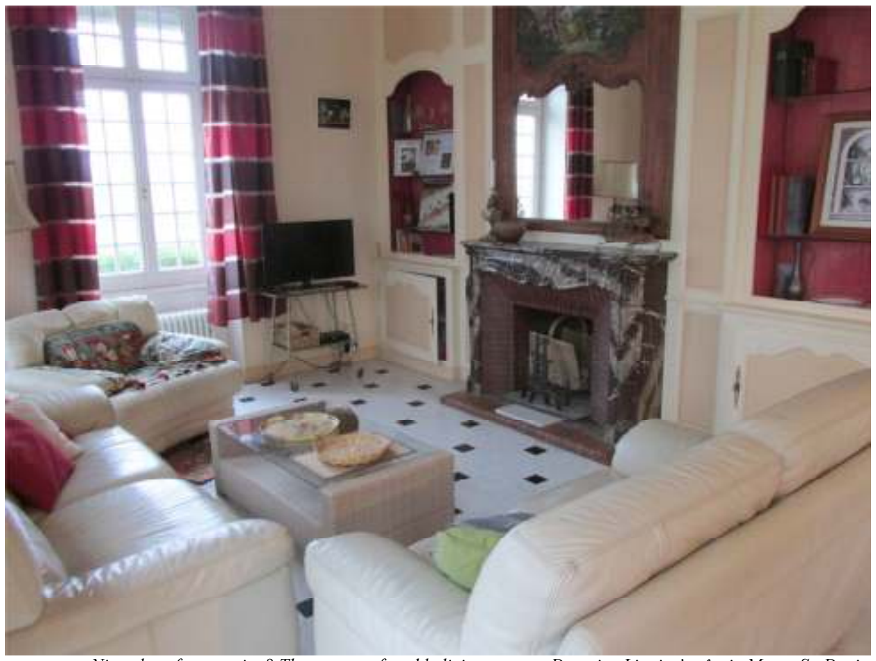
Nice place for a tasting? The very comfortable living room at Domaine Lignier's gîte in Morey St. Denis.