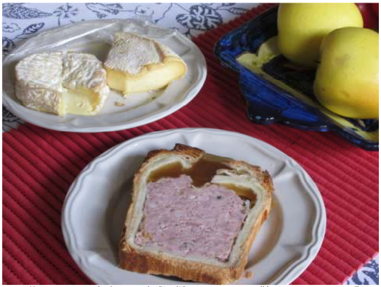
Not everyone comes for the wine in the Côte d'Or, as one can eat as well here as any wine region in France.