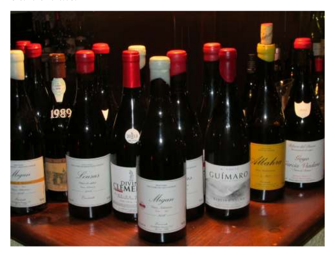
And a Few Very, Very Good Portuguese Wines

The 2015 Tintilla from Frontón de Oro is raised in older American oak casks for all of four months during its elevage , so this is not a particularly oaky wine. The 2015 version comes in at fourteen percent alcohol and offers up a fine bouquet of dark berries, bonfire, hung game, chicory, salty soil tones, just a whisper of US oak tones and a beautifully complex array of spice elements. On the palate the wine is deep, full-bodied, focused and beautifully balanced, with a fine core of fruit, excellent soil signature, moderate tannins and a long, poised and very complex finish. This is simply outstanding and one of the best wines I have yet tasted from Frontón de Oro! 2018-2040. 93.