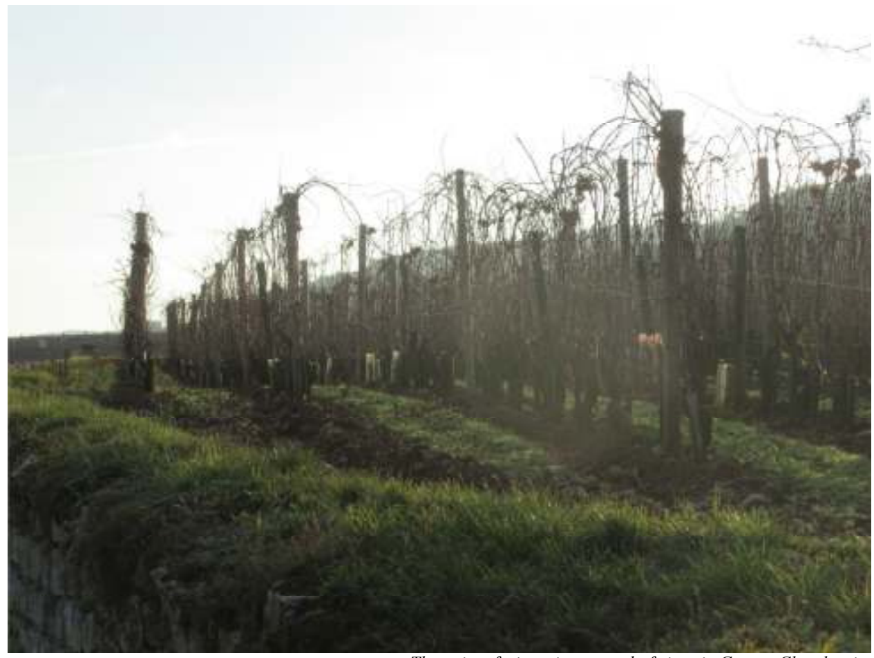
The quiet of winter in a parcel of vines in Gevrey-Chambertin.