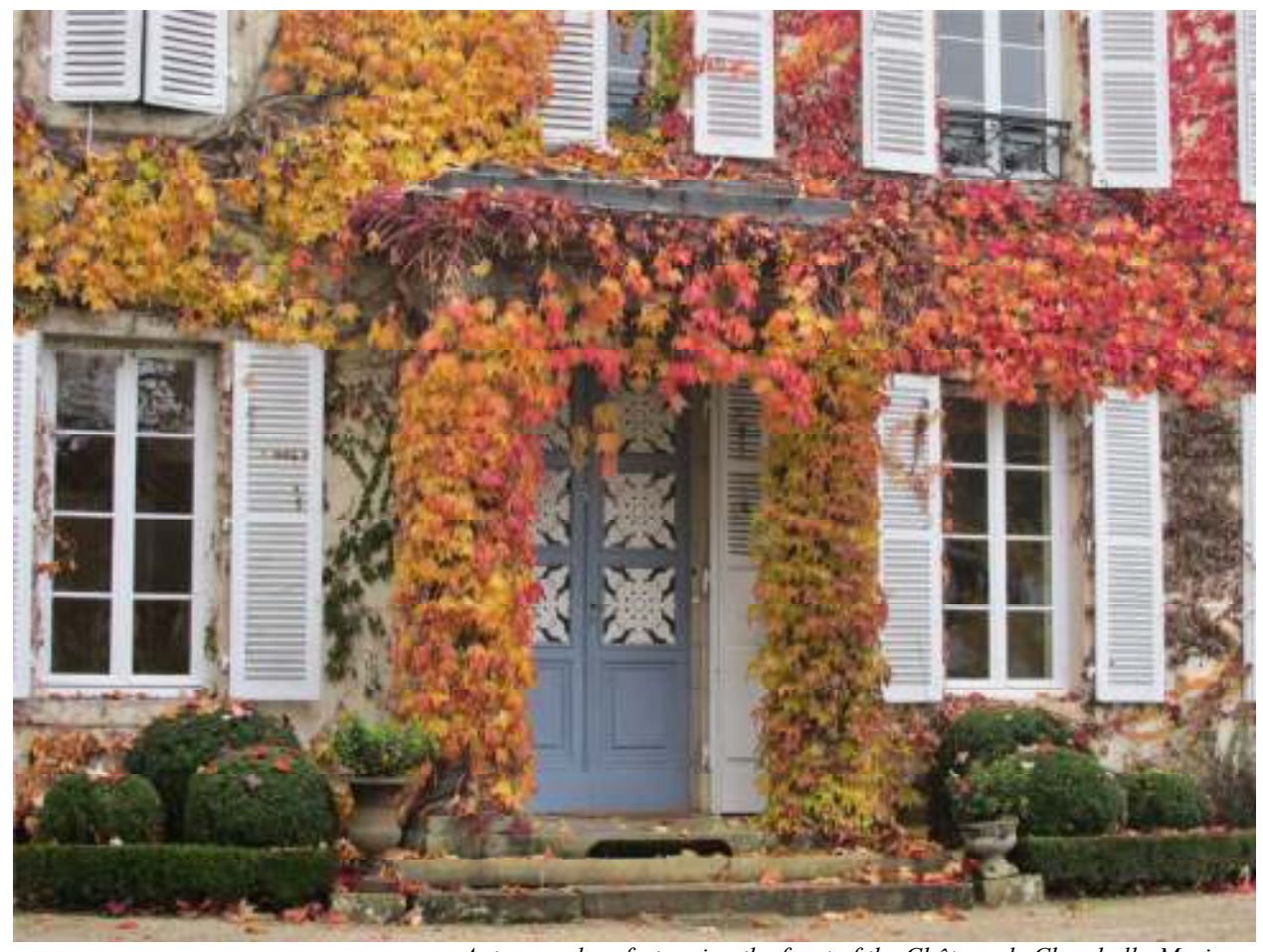
Autumn colors festooning the front of the Château de Chambolle-Musigny.