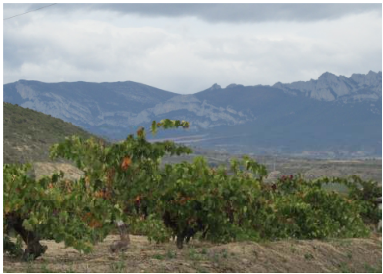
Tempranillo vines ready for harvest in Rioja Alavesa.

The 1968 Viña Bosconia "Gran Reserva" is now at its apogee of peak drinkability at age fifty and is drinking with marvelous vibrancy and complexity. The bouquet wafts from the glass in a refined blend of raspberries, cherries, a touch of cocoanut, lovely clove-like spices, dill, salty soil tones and cigar ash. On the palate the wine is pure, full-bodied and velvety on the attack, with a lovely core of fruit, great soil signature, melted tannins, tangy acids and outstanding focus and grip on the very long, very elegant and complex finish. This is simply beautiful. 2018-240. 95.