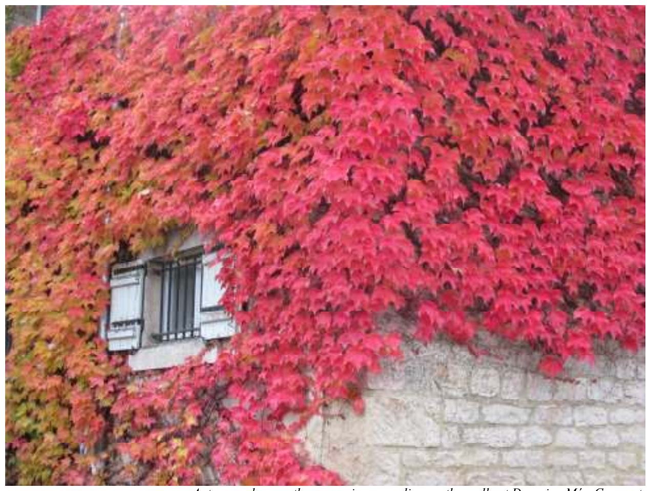
Autumn colors on the grapevines crawling up the walls at Domaine Méo-Camuzet.