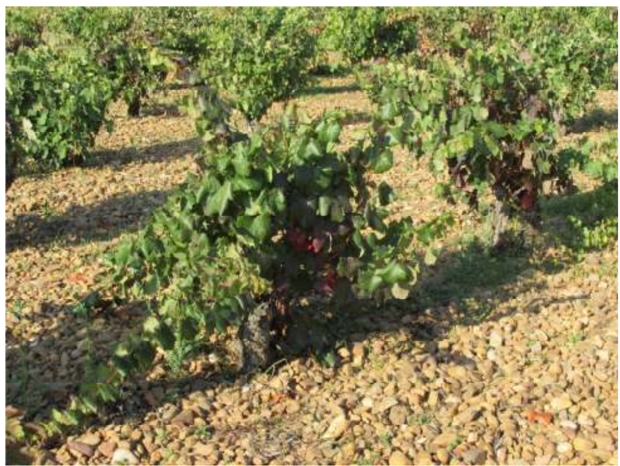
The great old Garnacha vines (destined for Rosado) and stony soils of Bodegas Catajarros in Cigales.

The 2013 Suriol Cava Rosado is composed of a blend of Garnaxta and Monastrell. It spent more than four years aging sur latte prior to disgorgement in May of 2018. The wine is a lovely salmon color and offers up a vibrant and complex bouquet of strawberries, blood orange, lovely spice tones, salty minerality, dried flowers and a smoky topnote. On the palate the wine is crisp, full-bodied and complex, with an excellent core of fruit, pinpoint bubbles and a long, well-balanced and racy finish. This is non- dosé and works best at the table or with tapas, where it is really, really good. 2018-2030. 91.