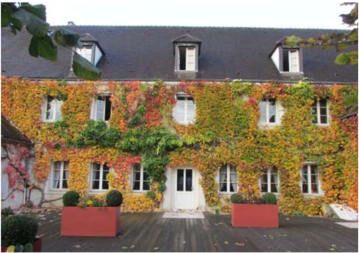
Autumn colors in the grapevines growing along the walls in the courtyard of the Hostellerie des Clos in Chablis.

frequently use to battle the frost, so that in these parcels- for example- at the bottom of Grenouilles, where it often frosts, we have measures we can use against it." However, as he noted, "in 2017, when our frost alarms went off, we got up and went to the usual spots in the vineyards that more often freeze and turned on the heaters, or some neighbors burned hay bales, but when the morning light came up, we discovered that the frost had hit a lot of vineyards and parcels that do not usually freeze and our efforts had not always been concentrated in the correct places." So, in the aftermath of the frosts of 2017, the Chablisienne were once again faced with yet another very short crop in 2017, and with the premier and grand crus disproportionately affected this year, the frost hurt even more economically than in 2016, when more villages level parcels of vines were frozen. Happily, the 2018 growing season was not one where frost played a role, so at least the yields in the coming vintage will help compensate a bit for two back to back very badly frost-affected vintages and very short yields.