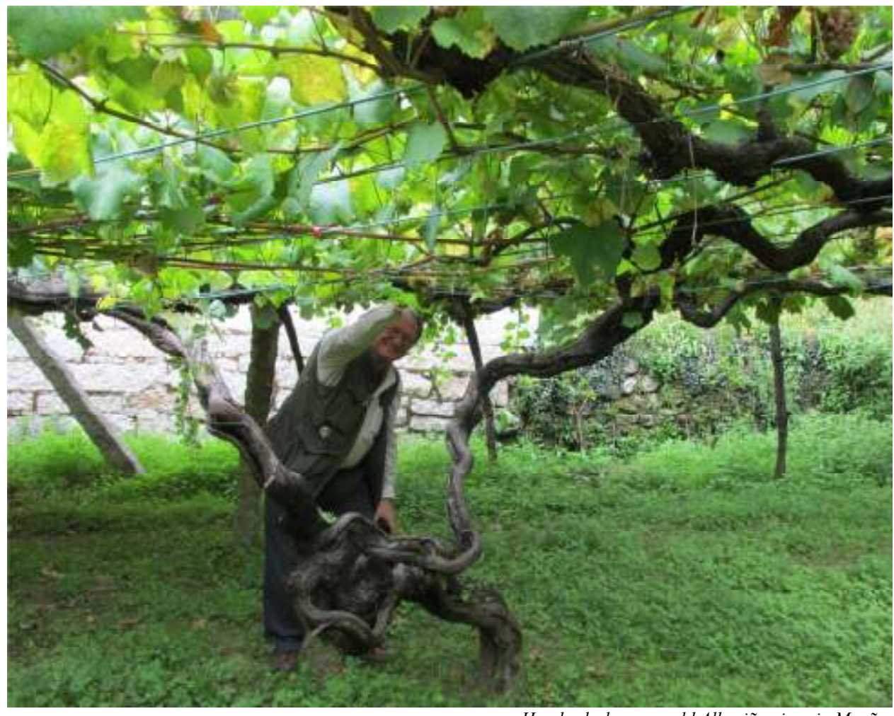
Hundred-plus year-old Albariño vines in Meaño.