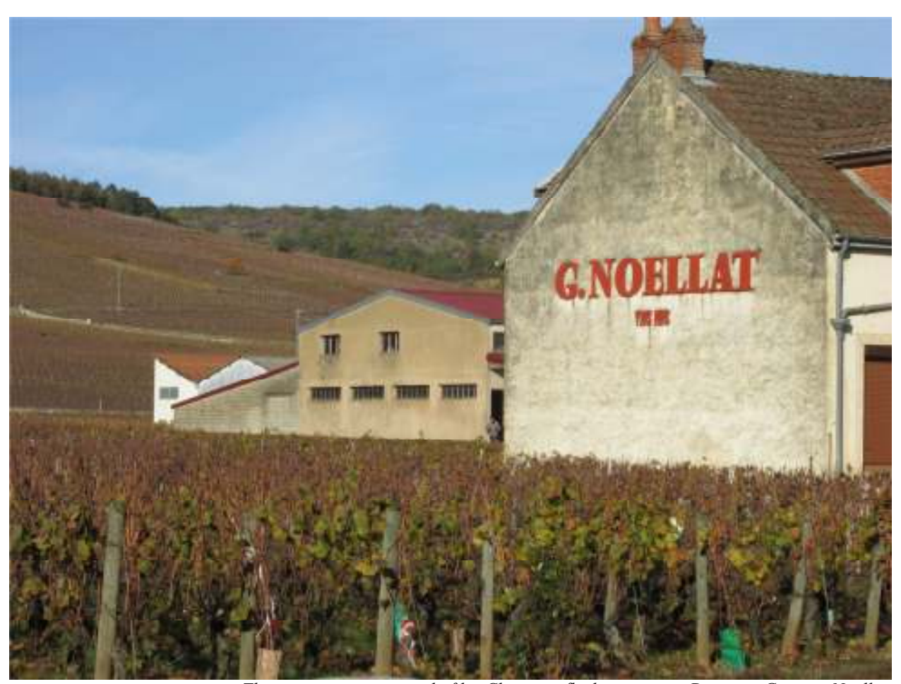
The premier cru vineyard of les Chaumes, flush up against Domaine Georges Noëllat.

The 2017 les Chaumes was the only wine in the cellar that seemed ready for its racking, as there was just a whisper of VA on the nose when the wine was first poured, but this vanished with a bit of swirling. The bouquet eventually is pure and expressive, offering up scents of black cherries, black raspberries, dark chocolate, gamebird, dark soil tones and spicy oak. On the palate the wine is pure, full-bodied and already quite suave on the attack, with a good core of fruit, fine complexity and grip, tangy acids and a long, suavely-tannic and very precise finish. A lovely example of Chaumes. 2023-2060+. 92.