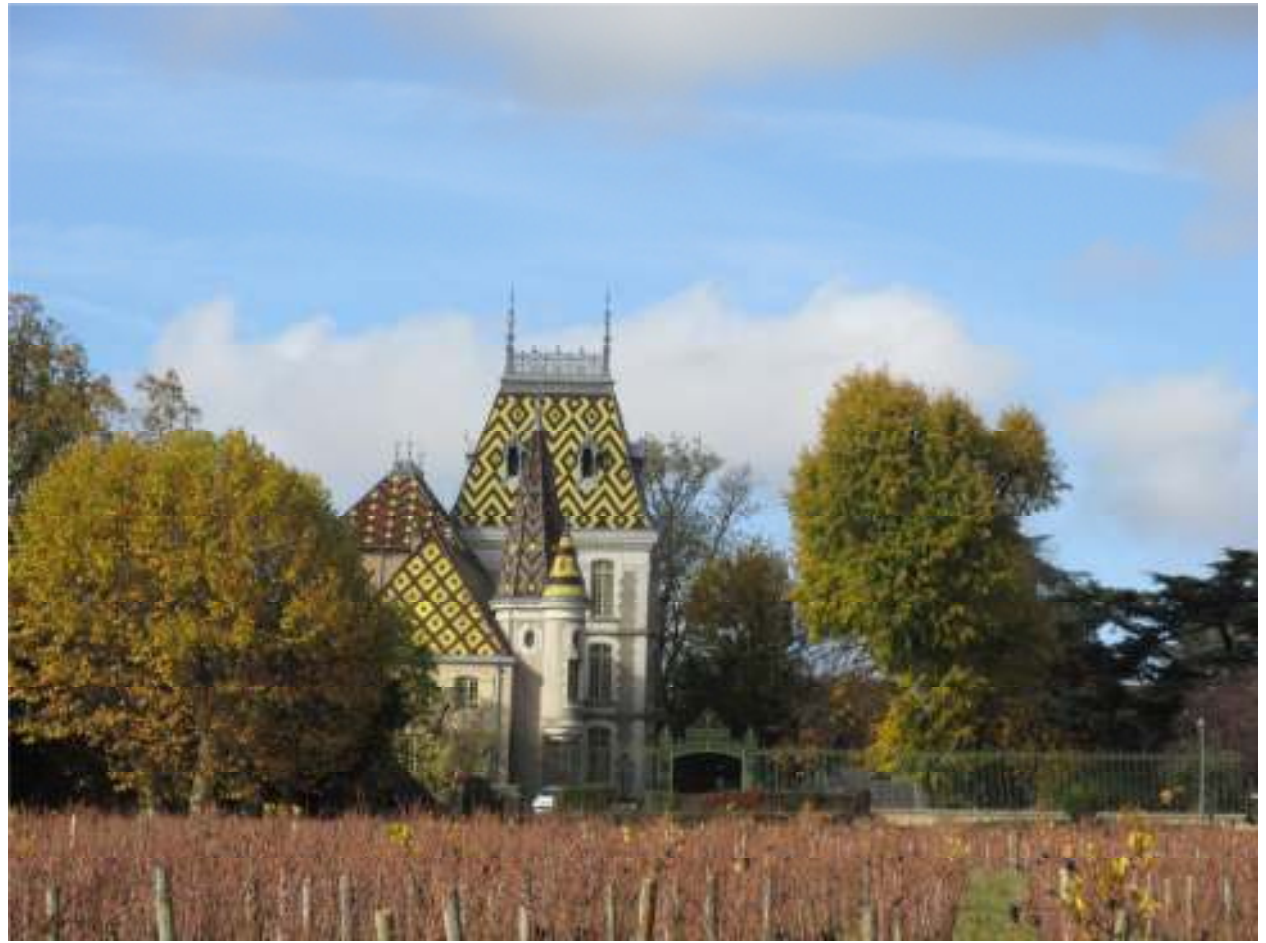
Another year looking across the vines to the village of Aloxe-Corton.

The 2017 vintage in Burgundy is far from homogenous, but for those who have fully captured the potential of the vintage, it is another stunningly high quality year and there are truly brilliant wines resting comfortably in the cellars of many, many domaines. The Burgundians in the Côte d'Or were able to sidestep another devastating episode of April frost damage in 2017, primarily by being proactive and doing what they could to protect their young shoots out on the vines when weather forecasts predicted another unseasonable plunge into freezing temperatures on the evening of April 26<sup>th</sup>. A great many vignerons took to their vineyards with bales of damp hay, which were burned in the wee hours of the morning to create a thick blanket of smoky air to protect the young shoots in the borderline freezing temperatures of the early morning. The year previously, the most egregious damage done by the frost of 2016 had been in the first few hours of light, when the sunlight focused its energy on the frozen and ice-enclosed young shoots on the vines, frying them through the prism of the ice coating and severely damaging the potential crop yields in the process. The remainder of the 2016 growing season had to live forever in the wake of that severe frost damage and the very low yields of the year will forever define the vintage. Happily for growers in most of the Côte d'Or in the April of 2017, the burning of the hay had