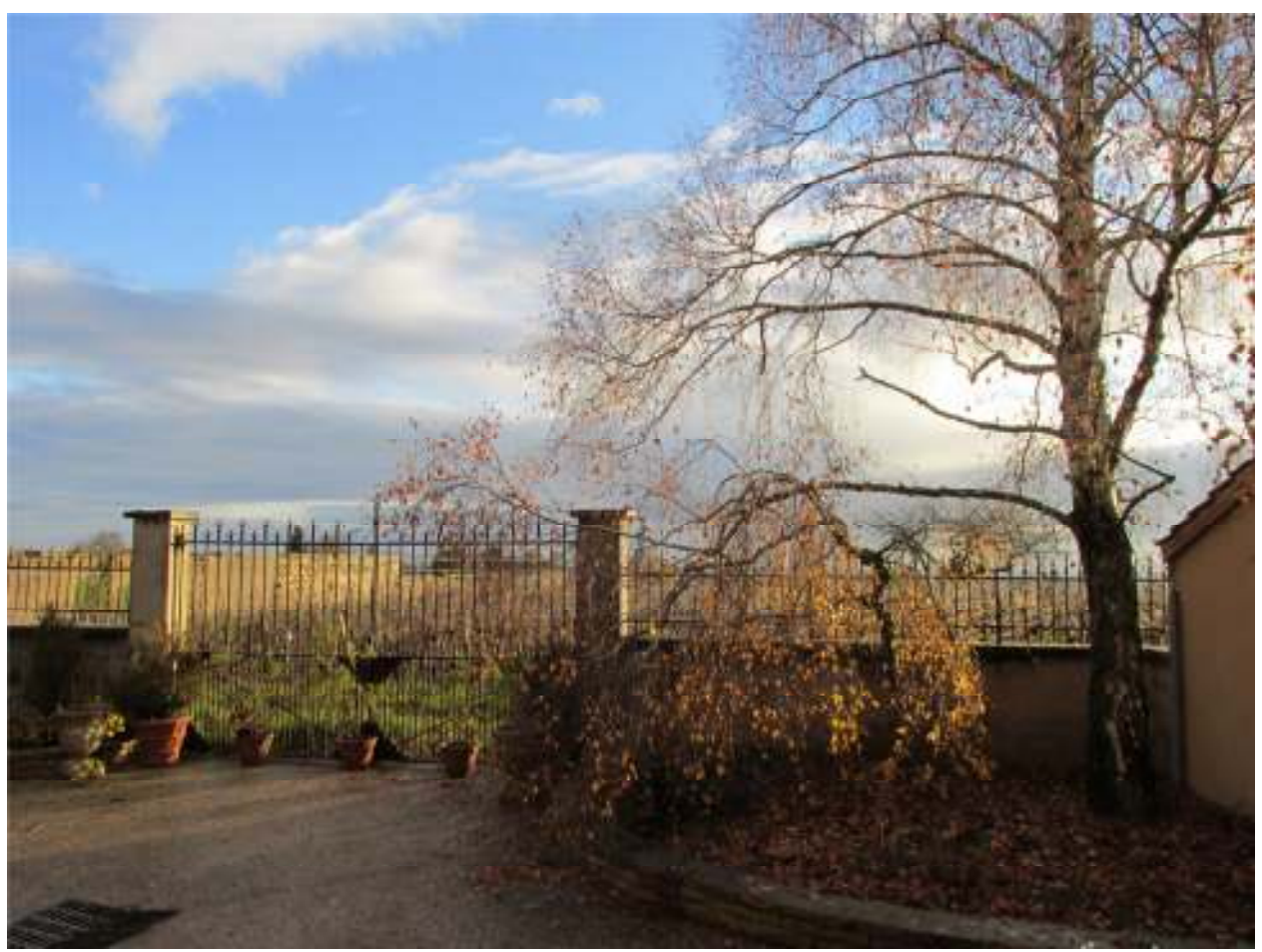
The vineyard of Feusselottes, just on the other side of the fence from Domaines Barthod and Boillot.

The 2017 Beaux Bruns was the only wine in the cellar that was not singing at the time of my mid-November visit to Domaine Barthod, as the wine was just a touch reductive and needed a bit of coaxing to express itself. With some swirling the wine offers up a promising bouquet of red and black cherries, plums, raw cocoa, a fine base of soil, pigeon and vanillin oak. On the palate the wine is deep, full and focused, with a rock solid core, lovely balance and grip, ripe tannins and a long, youthful and promising finish. Good juice, 2027-2065. 92+.