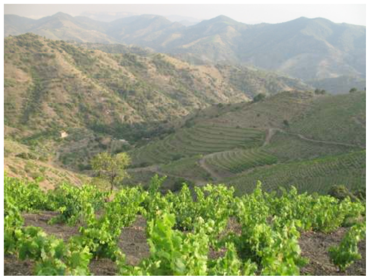
The beautiful, rugged vineyard terrain of Priorat.

When first opened, the 2015 Obstinat bottling of Xarel-lo from Joan Rubió is far more "natural wine" inflected on the nose and palate than the Essencial bottling. For some, this will be a positive, and for others, not so much. With some swirling, the nose cleans up to offer scents of lemon, green olive, bread fruit, saline soil elements, dried flowers, a touch of menthol and a topnote of raw almond. On the palate the wine is medium-full, crisp and complex, with a good core, fine soil signature, bright acids and very good length and grip on the slightly wild finish. After first pulling the cork, I really did not like this wine, which I thought was going to prove to volatile and wild for my palate, but with some coaxing, it really changes dramatically and for the better. The bouquet ends up being really fine, and though it never quite cleans up its act on the finish, the natural wine wildness here is a very minor note on the tail end of the finish and the wine really blossoms nicely. Count me as one of the very surprised! 2018-2023? 90.