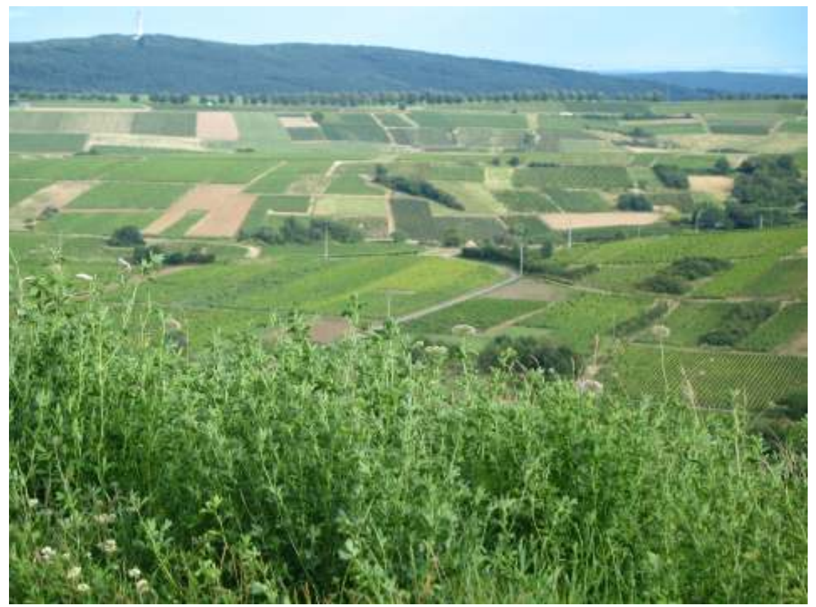
The quilt-like mosaic of vineyards in Sancerre in high summer.

It has been a bit longer than a year since I last did a report on the lovely wines from the Loire Valley, but tastings and other featured have piled up a bit over the course of this year and annual reports such as this have been pushed back a bit as a result. Consequently, this feature now straddles the gap between two vintages, as the 2011 vintage has been out for a while already and the very first wines of the 2012 vintage are already starting to be released. The two vintages both possess some lovely wines, but they are quite different in nature and neither one was what a vigneron along the Loire River would term "ideal". I will, of course, be covering the 2012 vintage in far more detail in next year's report, once the vintage's wines more fully arrive on the market, but I will at least touch upon some of the characteristics of the year here, given that several 2012s are reviewed in the pages that follow. 2012 was a very tough year in some sections of the Loire, as the growing season was extremely difficult (as was also the case in Burgundy in this vintage), with growers constantly fighting against vineyard depredations during intermittent periods of rain and sun, and hail was also a major challenge in parts of the region- particularly in the central Touraine section in 2012. (As I write the finishing touches on this article, I also hear that the Touraine has again been ravaged by midsummer hail in 2013, with hailstones the size of golf balls ripping through the vineyards