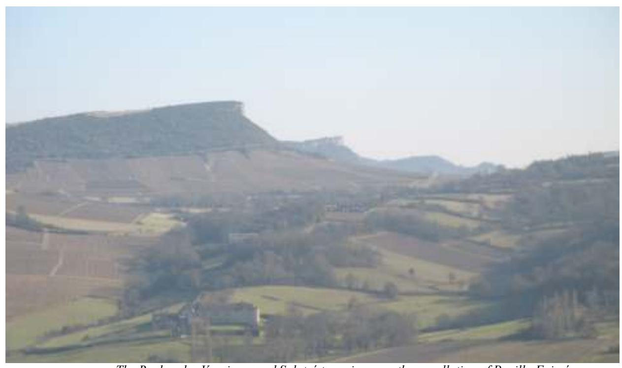
The Roches des Vergisson and Solutré towering over the appellation of Pouilly-Fuissé.