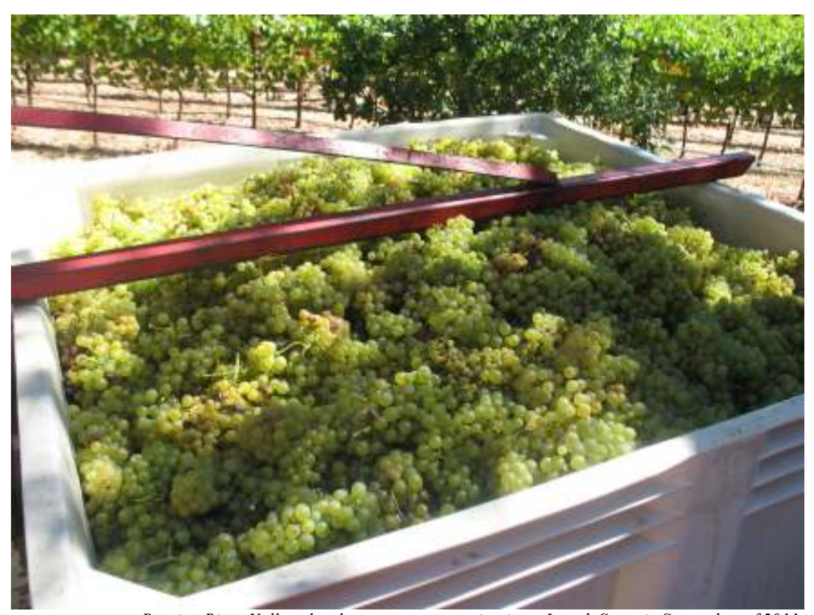
Russian River Valley chardonnay grapes coming in at Joseph Swan in September of 2011.

level of alcohol is in any given vintage. Of course the numbers have some "wiggle room" on US wine labels, so reported levels are often inaccurate, and additionally, the percentage of alcohol seems to be getting harder and harder to read on labels in any case as wineries out west seem to be in competition to see who can use the smallest typeface and the lightest possible print color for conveying this information these days. But, I have still studiously reported the levels in many cases, at least to demonstrate that the lower stated octane levels on many of the wines from the traditionalists suggest that we are really on the edge of a sea change that may well usher in a second renaissance for American wines.