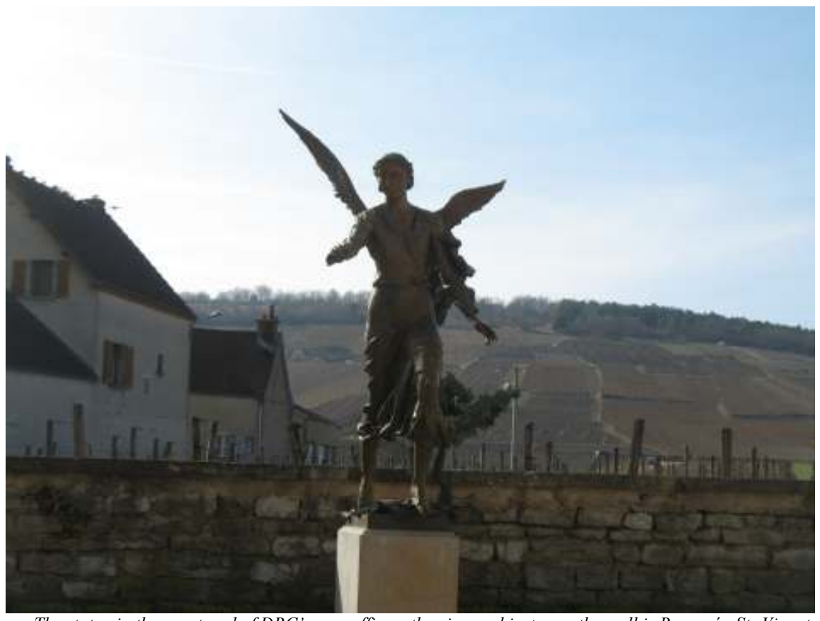
The statue in the courtyard of DRC's new offices- the vineyard just over the wall is Romanée-St.-Vivant.