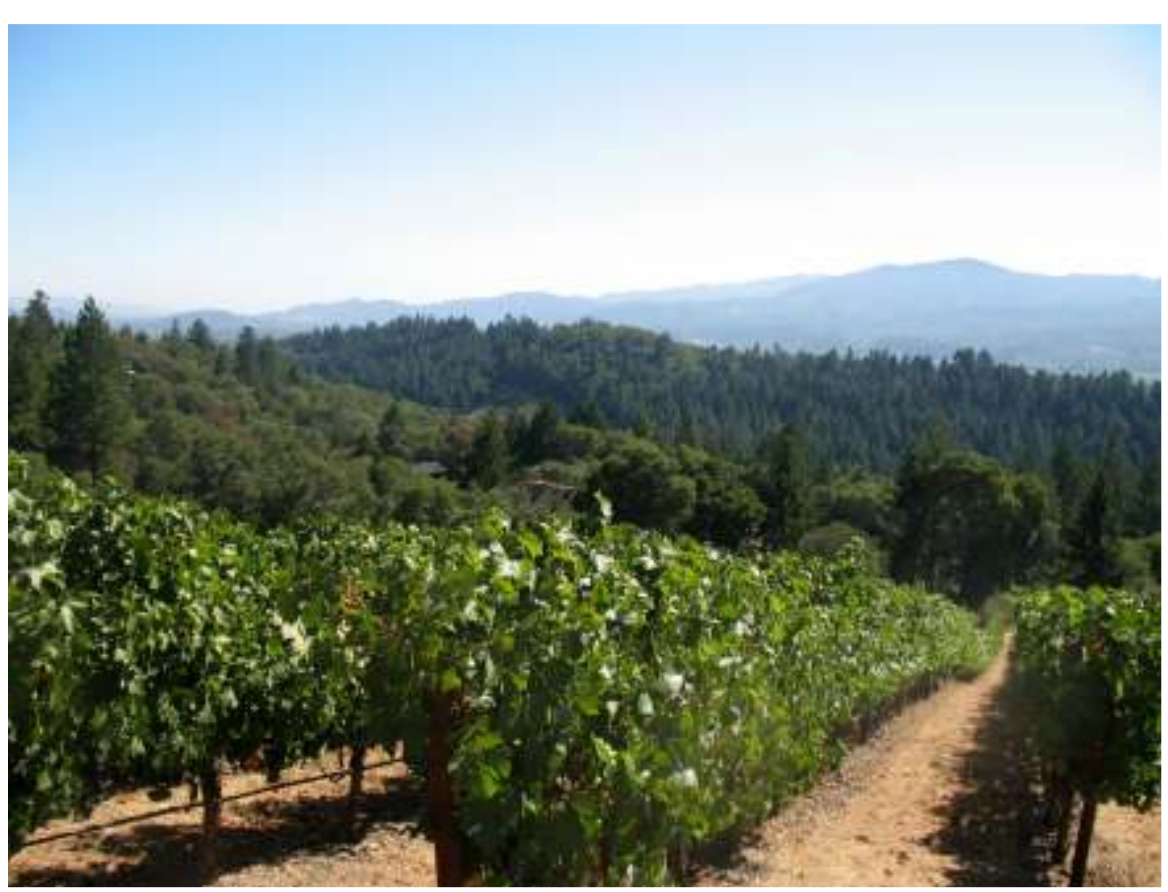
Cabernet franc vines nearing picking ripeness in Ric Forman's vineyards on Howell Mountain.

The 1985 Napa cabernet from Randy Dunn is still a fairly young wine, but it is starting to stir on both the nose and palate and is probably only about five years away from really beginning to drink well. The deep and impressively complex bouquet offers up scents of black cherries, a touch of red currant, cigar smoke, a bit of dried eucalyptus, orange peel, a superb, complex base of soil tones, gentle spice nuances and cedary wood. On the palate the wine is deep, full-bodied and quite pure on the attack, with a lovely signature of soil, a firm and still fairly youthful structure, a rock solid core, bright acids and a fair bit of tannin still to resolve on the long and nicely tangy finish. This was hermetically sealed for the first decade and a half of its life, but it is starting to turn the corner and there is going to be some superb long-term drinking in this wine's not too distant future! 2018-2045+. 94.