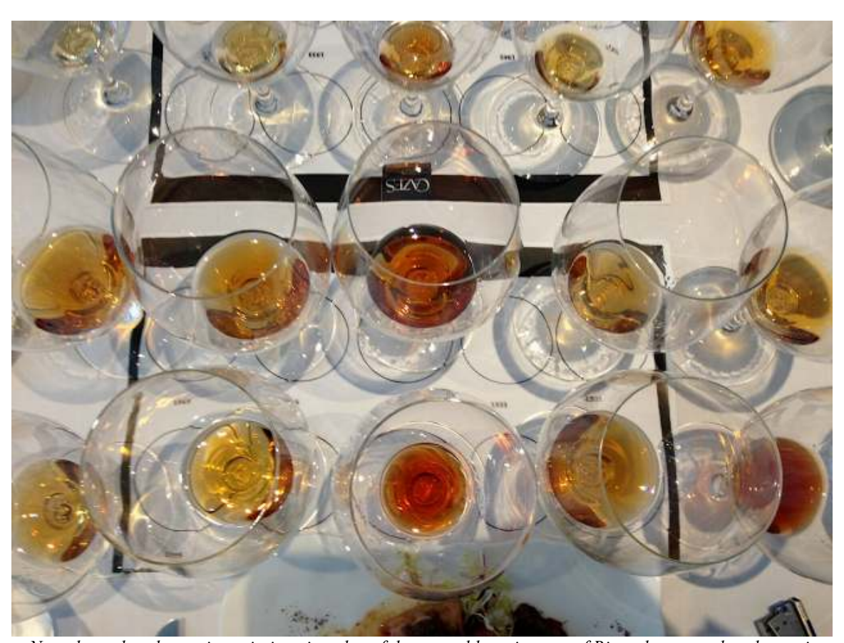
Note the rather dramatic variations in color of the very oldest vintages of Rivesaltes served at the tasting.

1960 is my birth year and I have had only a few truly memorable bottles from this vintage, and never any truly great wines until this stunning bottle of Hors d'Age from Domaine Cazes. This is one of the lighter-colored old vintages from the estate, indicating that it began life as an Ambré, and it is a touch drier than some of these old wines, but stunningly complex and poised. The color is a tawny amber, flecked with green at the rim (and quite reminiscent of some old Madeiras that I have had the pleasure to taste). The bouquet is vibrant and absolutely stunning in its complexity, jumping from the glass in a superb blend of white cherries, orange peel, savory elements that recall celery seed, cloves, salty soil tones and a nice dollop of clover honey. On the palate the wine is pure, full-bodied, beautifully complex and quite light on its feet, with less sweetness than the 1962, but more precision and soil inflection, laser-like focus, a rock solid core and outstanding length and grip on the perfectly balanced, moderately sweet and tangy finish. This is one of these great old vintages of Rivesaltes that I would love to serve with a savory course! 2013-2060. 95.