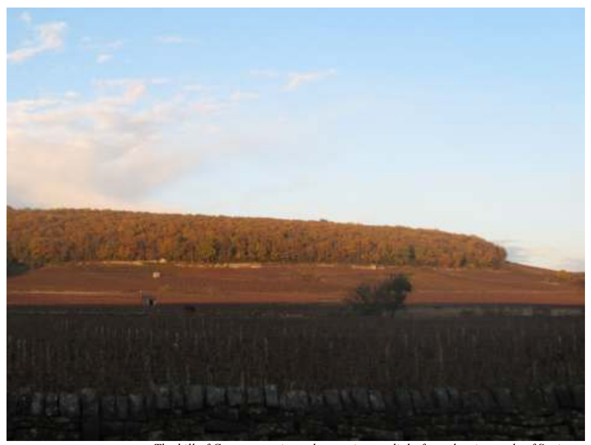
The hill of Corton seen in early morning sunlight from the vineyards of Savigny.

base of new wood. On the palate the wine is deep, full-bodied, pure and ripely tannic, with fine focus and mid-palate depth, nascent complexity and a very long, ripely tannic and classy finish. Superb juice. 2-25-2065. 94.