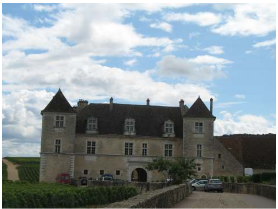
The Château de Clos Vougeot on a beautiful summer afternoon- not taken this June!