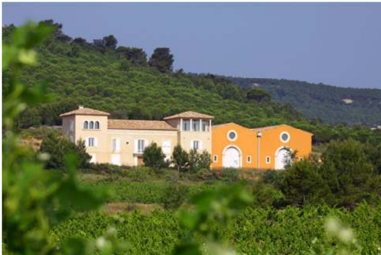
The fine Corbières estate of Château Montfin, nestled into the hills of the Languedoc.