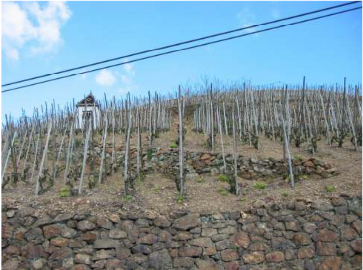
One of René Rostaing's parcels in the steep, terraced vineyard of Côte Blonde.

The 2005 Condrieu from Yves Gangloff was fashioned at a full fifteen percent alcohol, so it is not too surprising that the wine has not lasted a decade in the bottle particularly well and is now a less than exhilarating glass of wine. The wine is quite golden in color and offers up a nose of marinated fruit tones, orange peel, white cherries and hazelnut butter. On the palate the wine is full-bodied and still reasonably complex, with framing acids, a bit of backend heat from the octane and modest length and grip. The high alcohol here is not so much felt by making the wine hot on the finish, but more so for the overt bitterness it adds to the backend. It is okay for its heady octane, but not something I would have ever put in my own cellar. 2015-2020. 84.