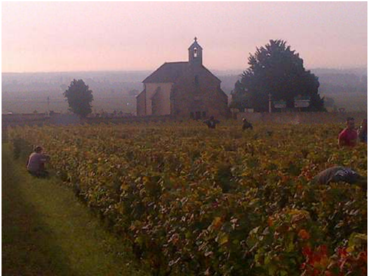
The exceptional Volnay premier cru Monopole vineyard of Clos de la Chapelle.

core, lovely soil signature, ripe, fine-grained tannins and outstanding length and grip on the nascently complex finish. This will need a few more years than the Chanlins to start to stir, but it will be every bit as marvelous at its apogee. 2028-2075. 94.