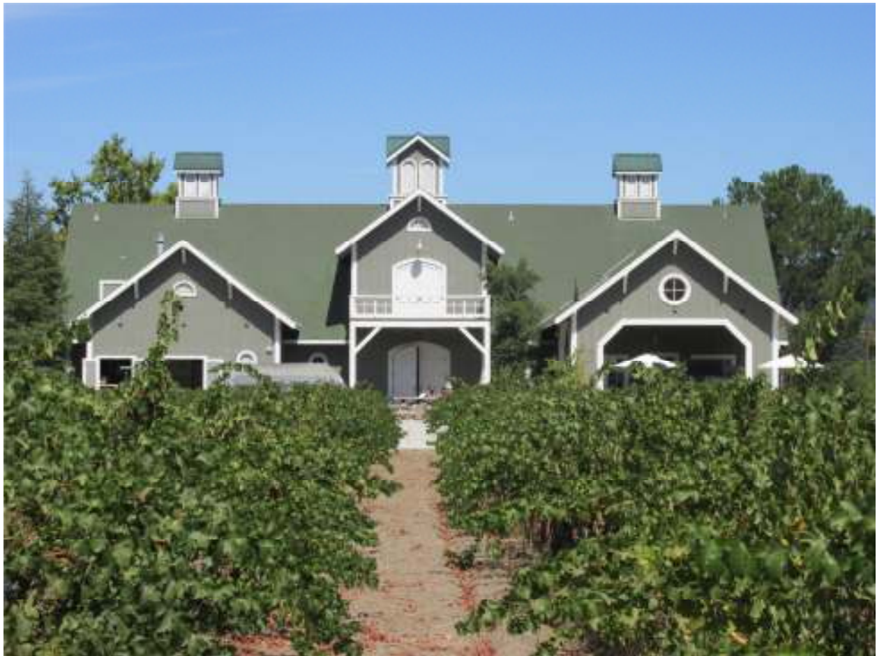
The back of the barn-like Corison winery, as seen from the heart of the Kronos Vineyard.

under cellar technique, heavy-oaking and late-harvest styles, it is easy to forget that this is one of the most important terroirs that put California front and center in the international wine world back in the decade of the 1970s.