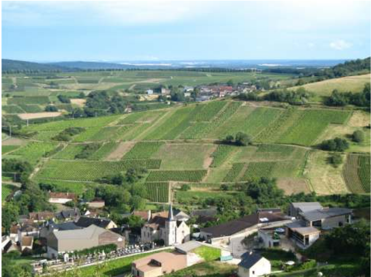
Looking down on the village of Chavignol from the top of the Monts Damnés.

bottling of the ripest grapes, which would be called “Cuvée Spéciale”. In the old days, the Cuvée Spéciale would normally hail from the last-picked or botrytized grapes in La Grande Côte in extraordinary years, but as sugars began to mount everywhere in our era of climate change, it was not practical to make more Cuvée Spéciale and less of the other bottlings and starting to pick a bit earlier was the logical response. But, one should not understate how difficult this decision must have been for François Cotat to take, as tradition here is the river on which the Cotat boat has floated for three generations, and given the long, long line of utterly remarkable wines fashioned here by the family as the decades have rolled by, changing traditional practices can only have been resorted to when all other possibilities were examined and rejected.