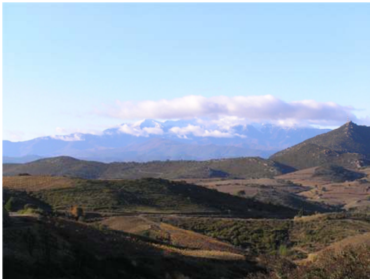
The rolling hill vineyards of Domaine Gauby, with the Pyrenees in the background.

one hundred and twenty years of age! The vines are planted in stony soils of marl and schist. The 2013 shows plenty of old vine depth in its aromatic constellation of cherries, black raspberries, roasted meats, coffee, cloves, stony minerality, bonfire and wild fennel. On the palate the wine is deep, full-bodied and sappy at the core, with great soil signature, impressive complexity, ripe, suave tannins and excellent length and grip on the focused and spicy finish. This too is already drinking nicely, but has room to grow and will be better with another four or five years' worth of bottle age. 2017-2035+. 92.