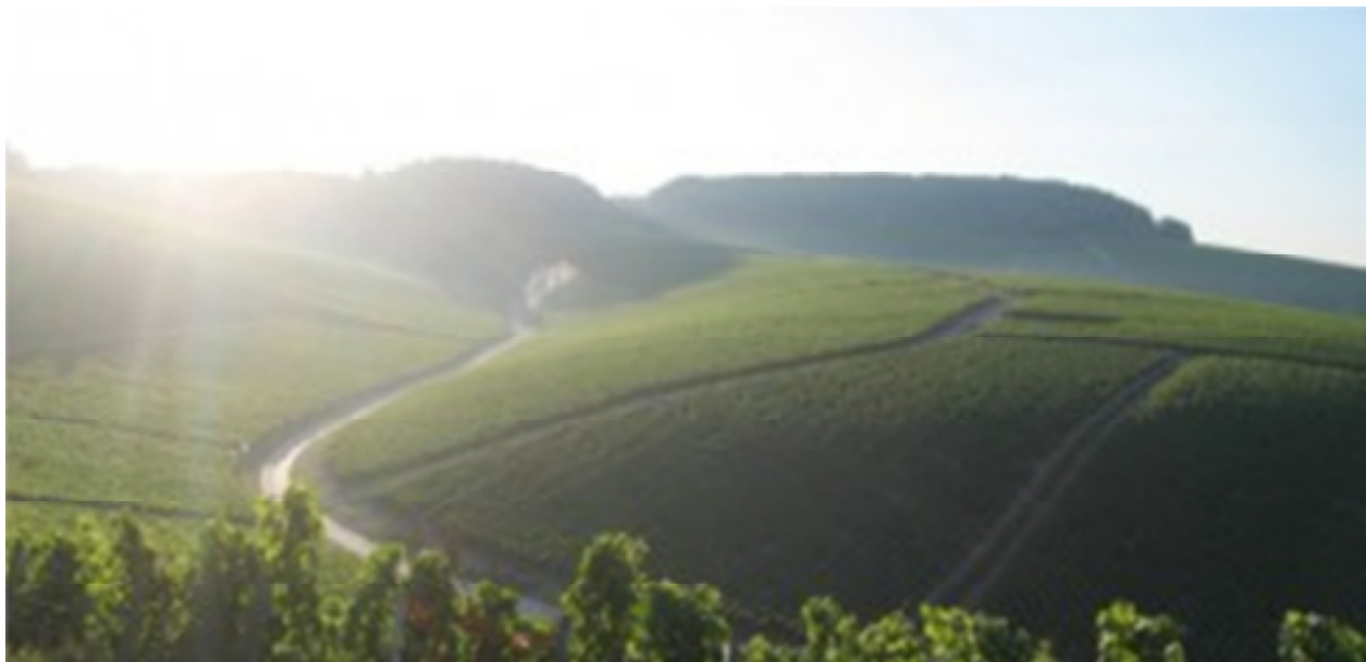
The sun blinking over the grand cru vineyard of Vaudésir.