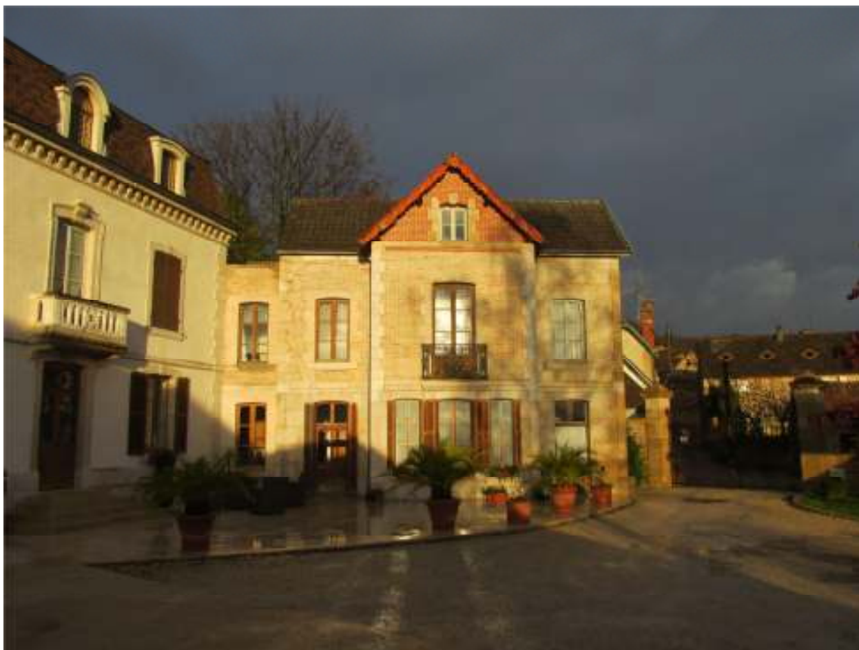
The winter sun slanting down on the Barthod-Boillot maison in Chambolle-Musigny.