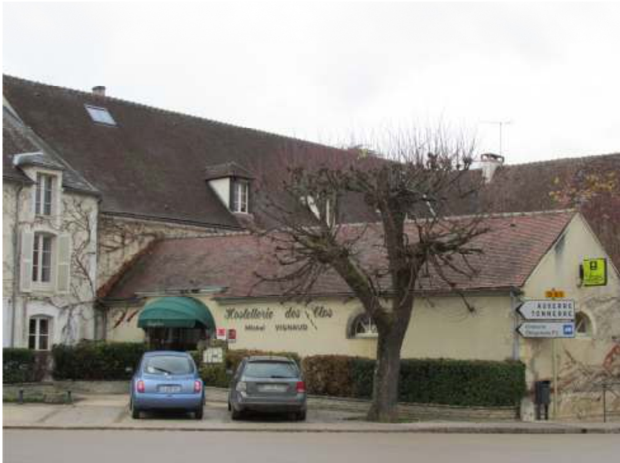
Michel Vignaud's marvelous Hostellerie des Clos in the heart of Chablis.

The 2014 Valmur was one of the more agitated wines in the cellar after its racking into tank, but there are some really lovely raw materials on display here as well. The nose offers up notes of apple, lemon, pear, chalky minerality, beeswax, citrus zest and spring flowers. On the palate the wine is deep, full-bodied and is rock solid at the core, with excellent cut and backend energy on the very long finish. I cannot wait to taste this with all of its constituent components in place! 2019-2050. 93-95+.