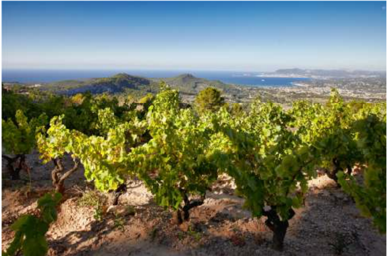
Château de Pibarnon's relatively high altitude vineyards, looking out at the Mediterranean Ocean.

I am a big fan of the 1993 vintage for Bandol, as I find it to be a very strong and very classic year in this corner of Provence. The '93 Pibarnon is a stellar bottle of Bandol at its apogee of peak drinkability, soaring from the glass in a blaze of baked black fruit, licorice, Provençal herb tones, cigar ash, autumnal notes of fallen oak leaves, botanicals and a smoky topnote. On the palate the wine is deep, full-bodied and at its zenith, with outstanding focus and balance, a lovely core, great soil signature and a very long, very complex and vibrant finish. A gorgeous vintage of Pibarnon. 2015-2030. 93.