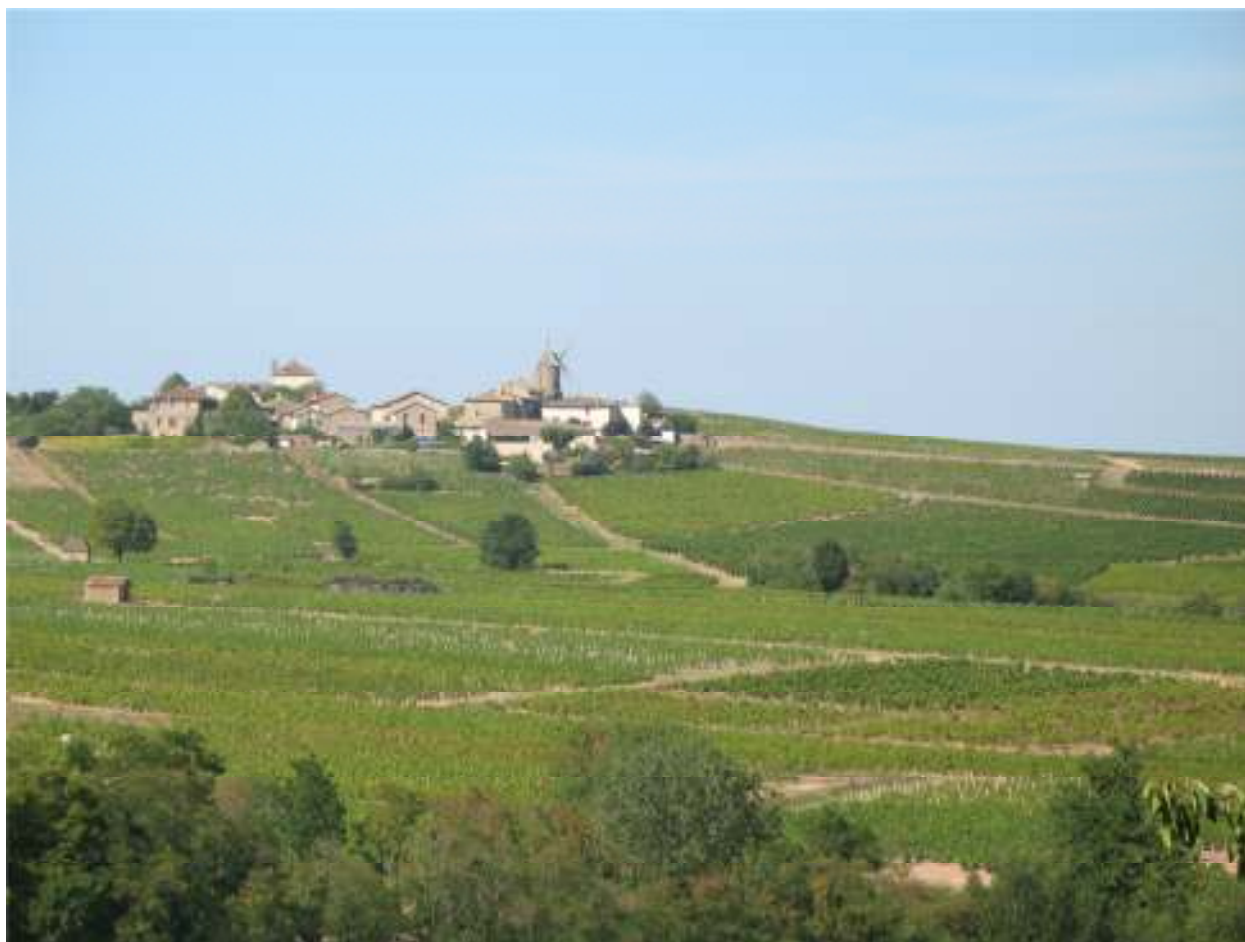
The famous windmill that gives the appellation of Moulin-à-Vent its name.

While both of these regions have been covered in good depth in the last couple of issues, a few late arrivals came across my desk towards the end of the year and notes are included below. From the Loire Valley, a pair the samples of the top Sancerre bottlings from Pierre Morin were corked when I was covering the region in the last issue and were replaced in December, so it seemed logical to print the notes here, so that subscribers can track these fine bottles down before they disappear from the market (which would certainly be the case if I held the notes back until the next big Loire feature at the end of next summer). From Beaujolais, I had the chance to taste several new releases from Maison Joseph Drouhin, the Lafarge family and Louis Boillot during my stay in the Côte d'Or in November, and had a few late arriving samples awaiting me back in New York on my return. For the same reasoning as printing the Domaine Morin tasting notes right now, I have grouped them in here so that the notes are available prior to the wines disappearing from the market. With Louis Boillot's three bottlings of Moulin-à-Vent, I have included expanded notes here, even though I tasted two of the three bottlings and wrote them up in my last piece on Beaujolais, as those bottles had just been shipped into the US from France and it seemed a good idea to also print notes on those bottles that had been quietly resting in his