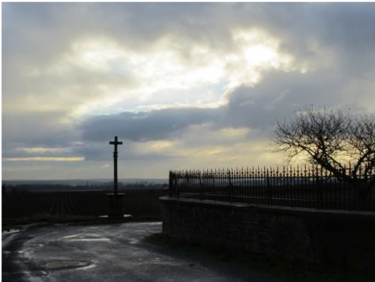
The vineyard of Feusselottes in Chambolle-Musigny, as the winter sun tries to break through the clouds.