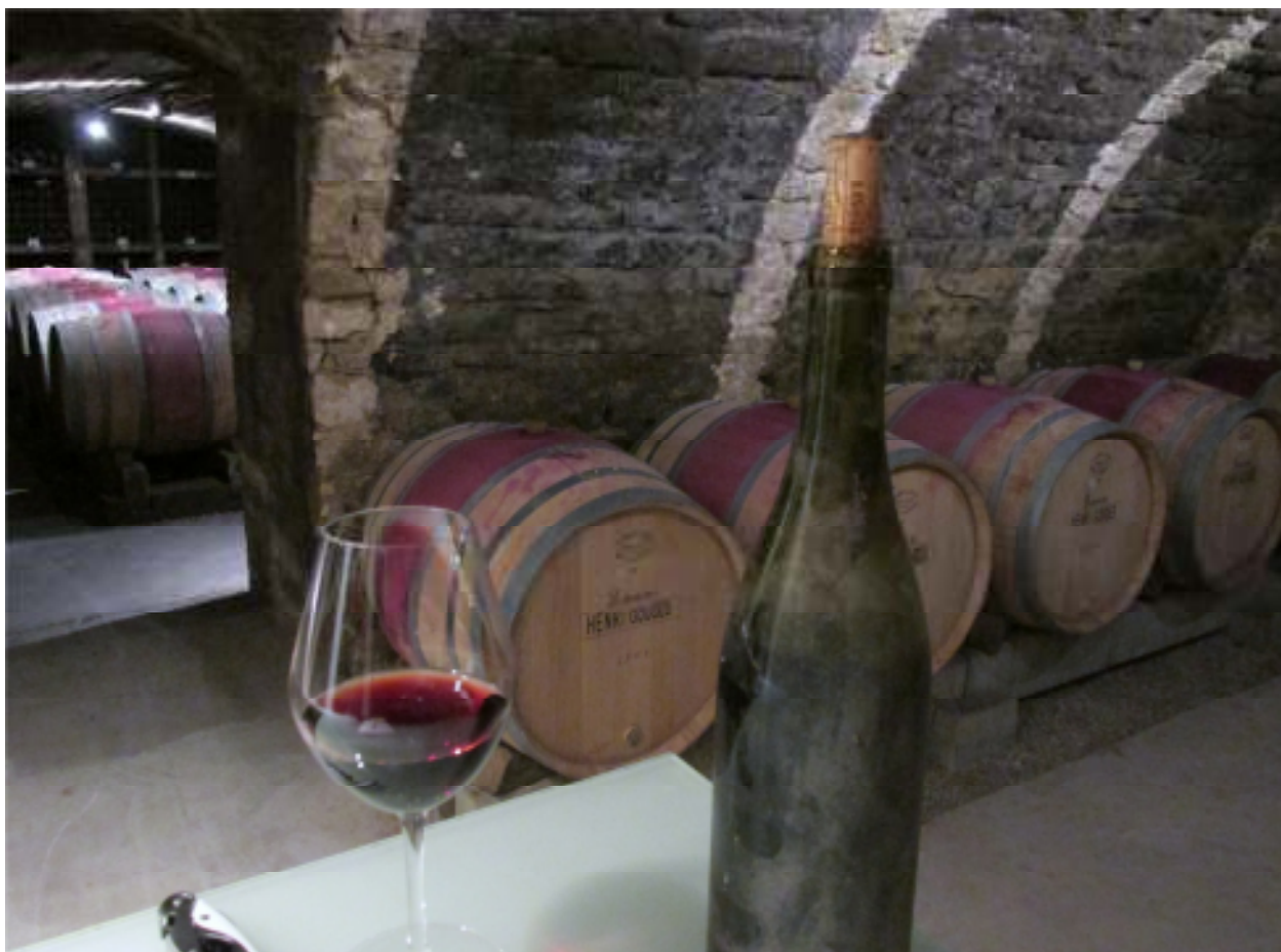
A glass of older Nuits St. Georges to properly finish up a recent vintage to Domaine Henri Gouges.