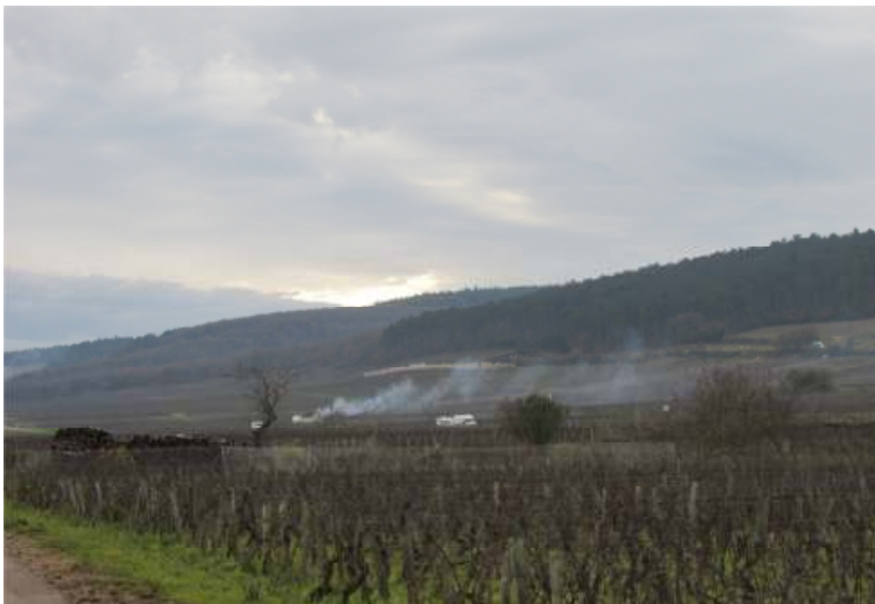
Winter pruning in the vineyards of Gevrey-Chambertin.