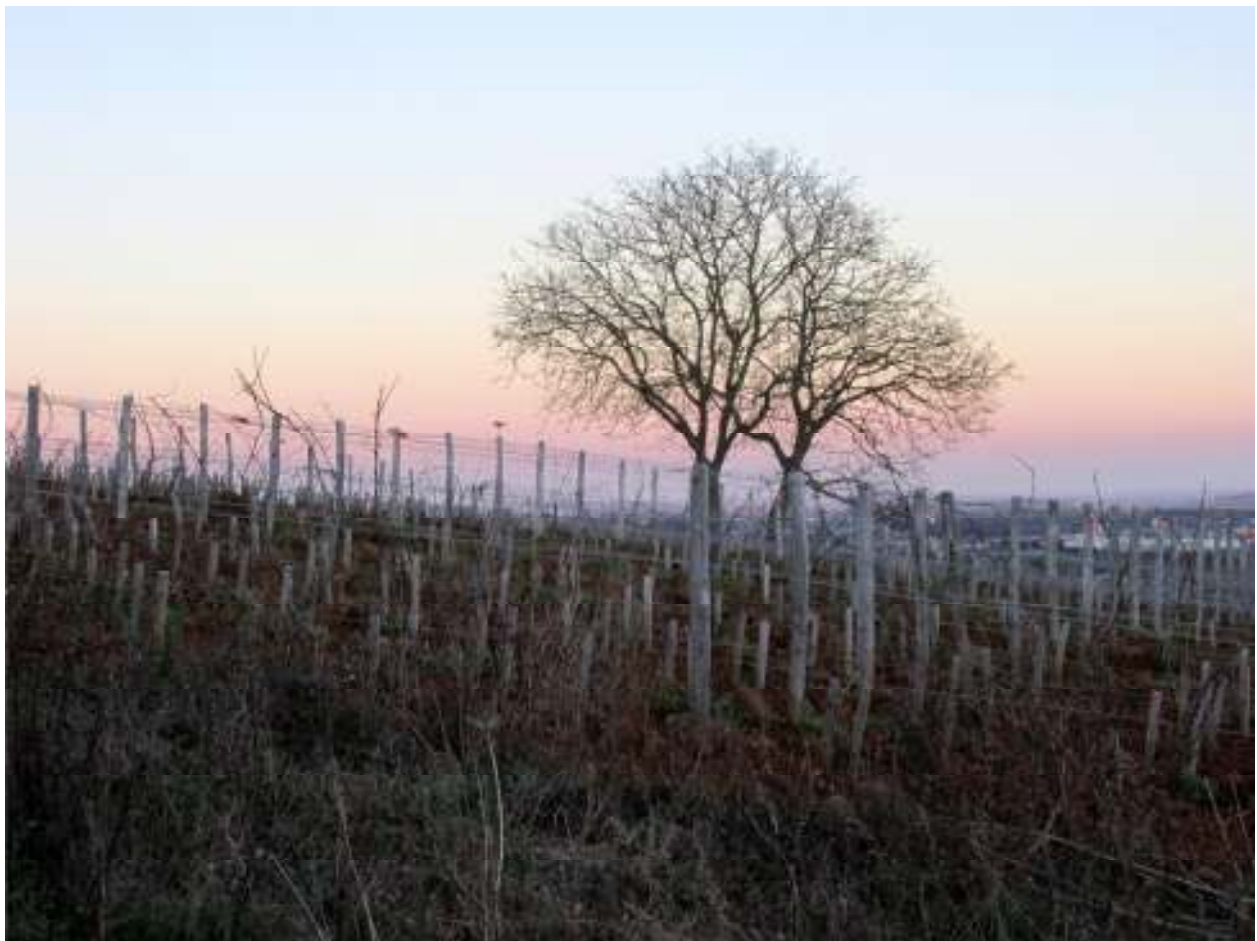
Late afternoon descending towards dusk over the Clos des Mouches vineyard in Beaune.

The 2014 Grands Echézeaux had been bottled in mid-August of 2015 and was still in a grumpy mood post-bottling. The bouquet offers up some lovely elements in its mélange of red and black cherries, woodsmoke, gamebird, cocoa, fresh herb tones and spicy new wood. On the palate the wine is deep, full-bodied, long and primary, with a fine core, ripe tannins and very good length and grip on the well-balanced finish. Today, this wine is more settled in on the palate than it is on the nose, which is still a bit all over the place after its mise , but the constituent components are all in place here for a lovely wine with sufficient cellaring. 2025-2075. 92-94 .