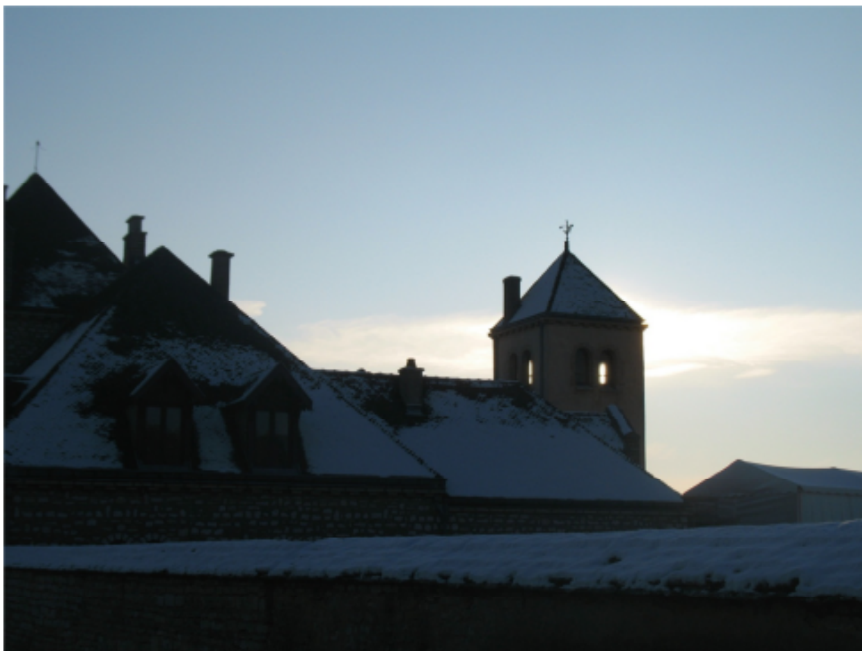
A dusting of snow coating the rooftops of Morey St. Denis.