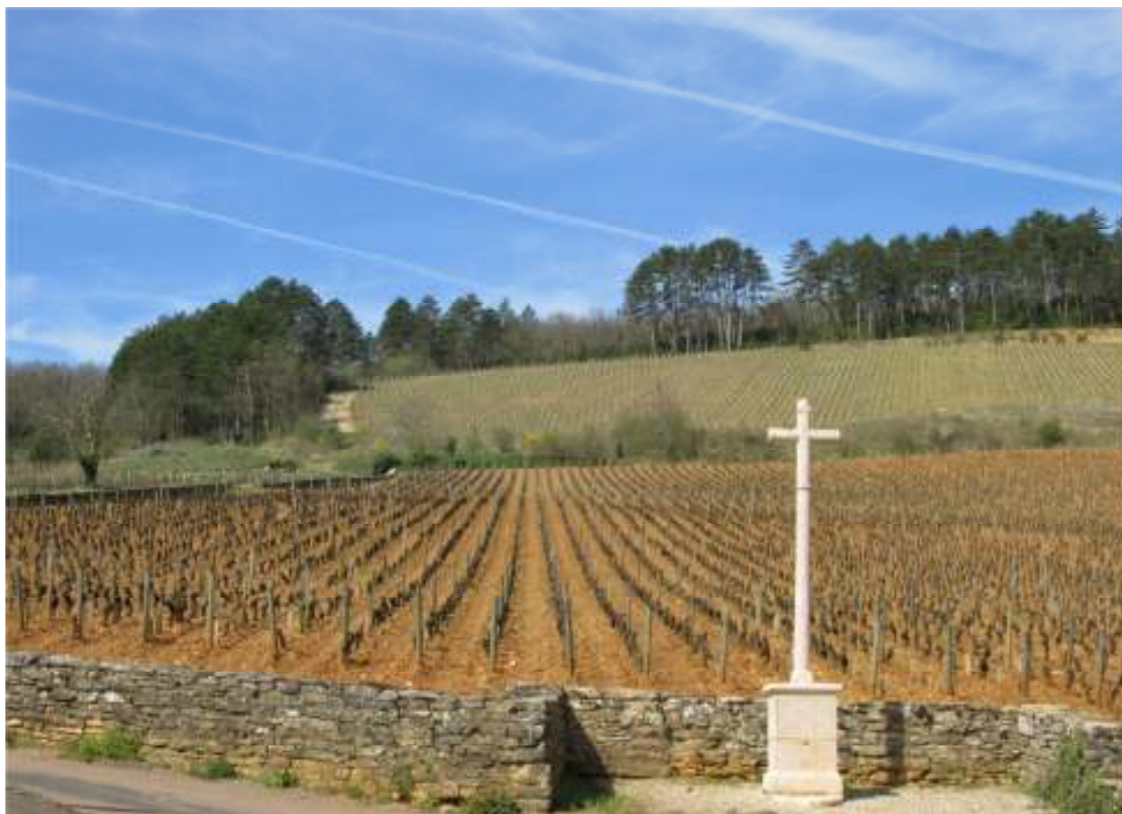
The vineyard of Les Vergelesses in Pernand-Vergelesses.