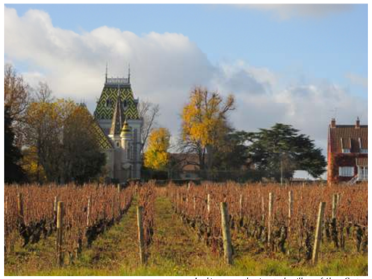
Looking across the vines to the village of Aloxe-Corton.

The 2016 vintage in Burgundy will long be remembered for the devastating frosts that struck so many top vineyards at the end of April of this year, causing severe damage and drastically cutting back the crop in the vineyards most affected by the freeze. But, at some point in the future, the superb quality of the wines will take precedence over the frost in the minds of most Burgundy lovers and 2016 will be remembered more for the excellence of the vintage. For a great many of the wines of 2016 are truly exceptional. It is an uneven vintage in some ways, as the frost damage was not the same in each parcel that was hit, and there are also plenty of vineyards that were completely spared any damage when the frost struck on the evening of April 26<sup>th</sup>. So, one sees a variety of styles to the wines, depending on whether the vines had any frost damage at all, and if they were hit by the frost, how severely the damage was, as some vineyards were merely touched and yields might be down anywhere from five or ten percent, but others were absolutely decimated and yields in these vineyards can be down by as much as ninety percent in the parcels most severely frosted on that cold morning. In fact, several bottlings are missing from their customary place in the lineups of certain domaines, as they simply did not have enough grapes to make wines from those parcels most damaged. To give just one example