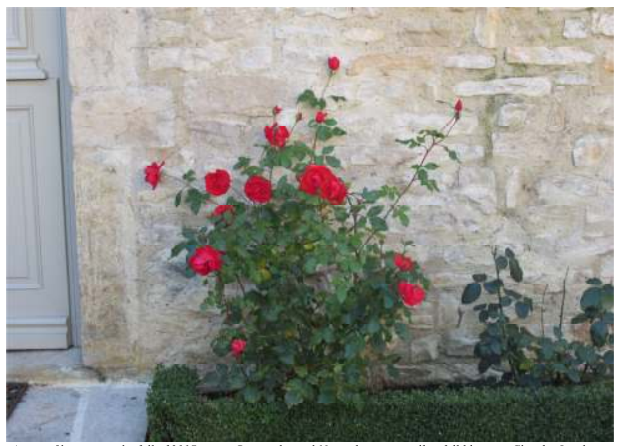
A sign of how warm the fall of 2017 was in Burgundy-mid-November roses still in full bloom at Clos des Lambrays.

wines were produced in very small quantities and allocations, which are already extremely complicated with the heavy veneer of profiteering that now defines today's Burgundy market, likely to be even more so with such short production numbers for a great many wines. However, some of the very best red wines of 2016 hail from non-frosted vineyards and in these cases, yields are excellent and there will be ample wine to be found for intrepid Burgundy lovers that care more about the actual quality of the wines they put in their cellars, rather than the simplistic market hype centered around vintages. For, as was the case with the 2009 reds, the very, very good 2015s have probably been overpraised to some extent by merchants looking to find another "boom vintage" to take long margins on, as they did previously with both the 2005s and 2009s, and this will affect how they present the 2016s when they trickle into the pipeline. This is not to say that the best 2015s will not be stunning wines in the fullness of time, but rather simply to reflect upon the fact that a lot of purple prose was attached to the significant price hikes taken on the 2015s, and twenty years down the road, there may well be a sizable percentage of 2016 reds that are even superior to their 2015 counterparts.