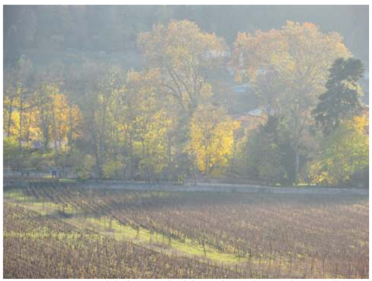
A little afternoon sunshine lighting up the November vineyards in Savigny-lès-Beaune.

The Pavelots' parcel of chardonnay for their Corton Blanc was up above the frost line in 2016, so this is the only cuvée in the cellars that had a normal crop load in this vintage! The wine has turned out brilliantly, offering up a superb aromatic constellation of pear, a touch of tangerine, fresh almond, chalky minerality, spring flowers, just a whisper of honeycomb and a judicious framing of vanillin oak. On the palate the wine is deep, pure and full-bodied, with lovely complexity and grip, just impeccable balance and a very long, poised and racy finish. Great juice. 2020-2045. 94+.