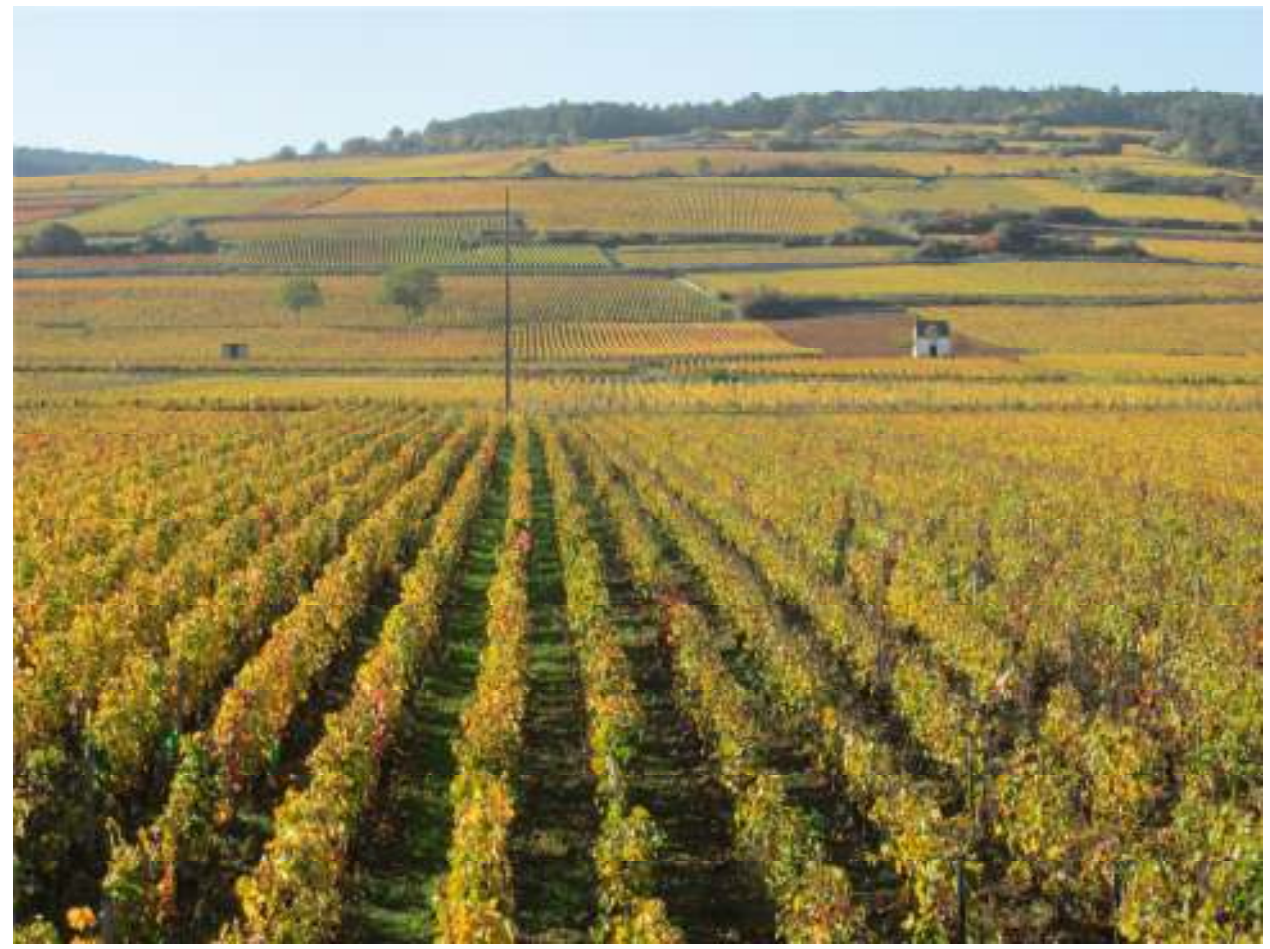
La Côte d'Or in all its October splendor.