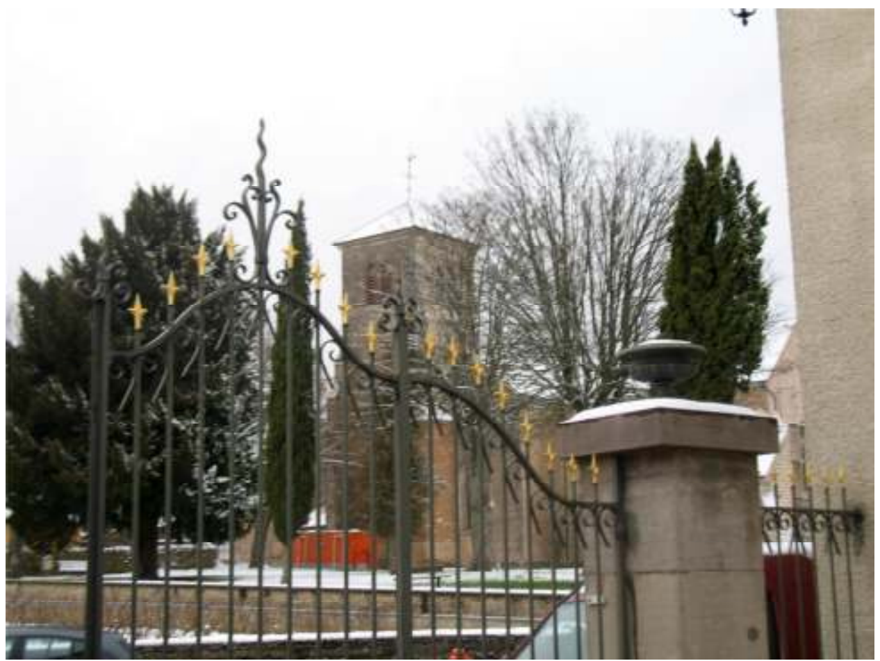
The snow-frosted church in Gevrey-Chambertin, as seen from the courtyard at Domaine Rousseau.

new wood component at the time of my visit, but has plenty of stuffing to do so without difficulty and will be a gorgeous wine in the fullness of time. The bouquet offers up a lovely and complex blend of red and black cherries, plums, dark chocolate, gamebird, a complex base of soil tones and vanillin oak. On the palate the wine is deep, full-bodied and again, very sappy at the core, with lovely soil inflection, ripe, suave tannins and a very long, energetic and nascently complex finish. 2026-2065+. 94+.