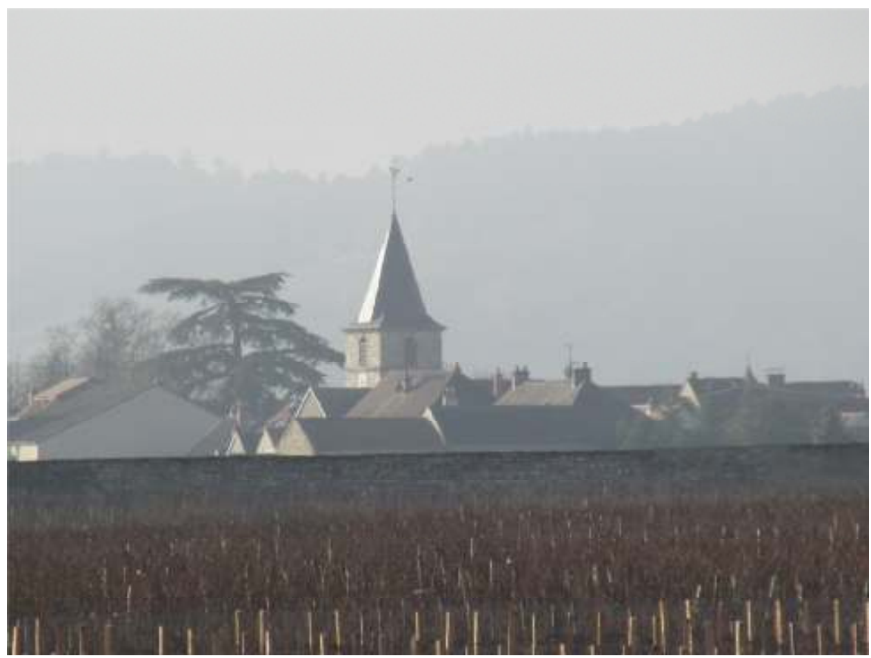
Looking across the Clos Vougeot to the village center of Vosne-Romanée in the hazy distance.