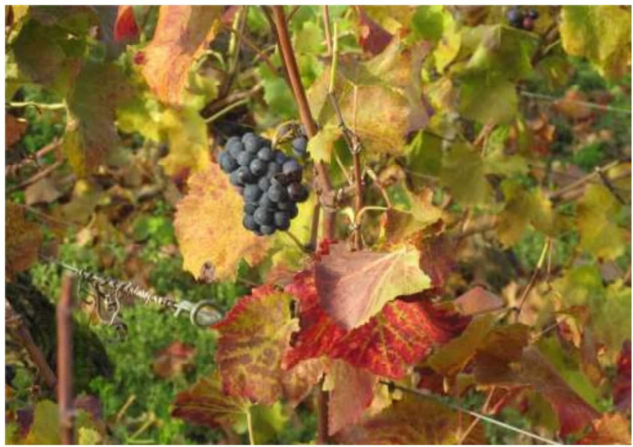
Second generation fruit from the 2015 vintage that was left out on the vines- these were sometimes used in 2016.