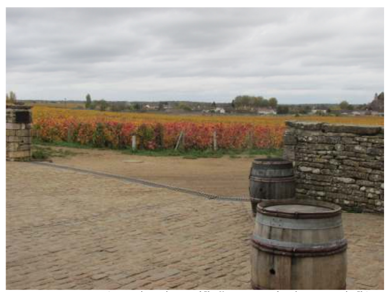
Autumn colors in the vines of Clos Vougeot, as seen from the entrance to the Château.

I do not know how to compare the quality of the two growers that Jean-Nicolas Méo had to exchange in this wine, as the customary supplier did not have grapes in 2016 because of the frost and the a new one was brought it, but the quality of the wine in 2016 suggests that the new producer is also doing very good farming here, as the wine has turned out beautifully. The bouquet offers up a superb mélange of pear, apple, hazelnuts, salty soil tones, a hint of the honeycomb to come and a deft framing of buttery oak. On the palate the wine is deep,. full-bodied, long and complex, with an excellent core of fruit, bright acids and excellent grip on the long and classy finish. 2020-2045. 94+.