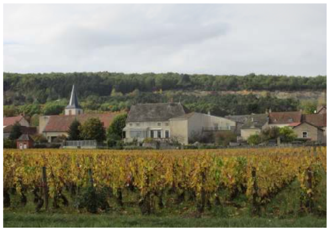
The premier cru vineyard of Maltroie, with the village of Chassagne in the background.