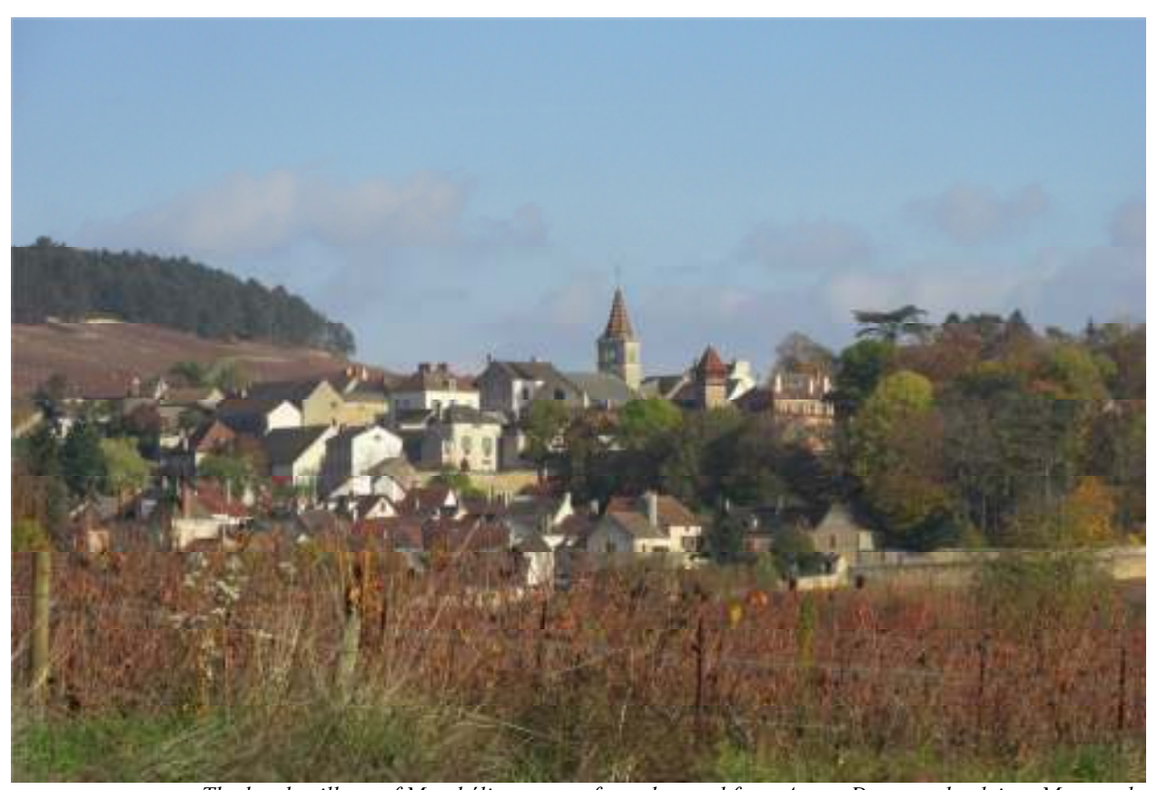
The lovely village of Monthélie, as seen from the road from Auxey-Duresses back into Meursault.

The Lafouge family's plot of vines in Chanlins were only modestly touched by the frost, so yields are down by fifteen percent in 2016. In the context of frost damage elsewhere, this was quite minimal. The resulting wine is going to be outstanding, as the bouquet is complex and very pure in its constellation of black cherries, a touch of plum, bonfire, espresso, pigeon , a gorgeous base of soil and a topnote of currant leaf. On the palate the wine is deep, full-bodied and very pure on the attack, with a sappy core, great transparency and a very long, focused and suavely tannic finish. Great juice. 2026-2060. 94.