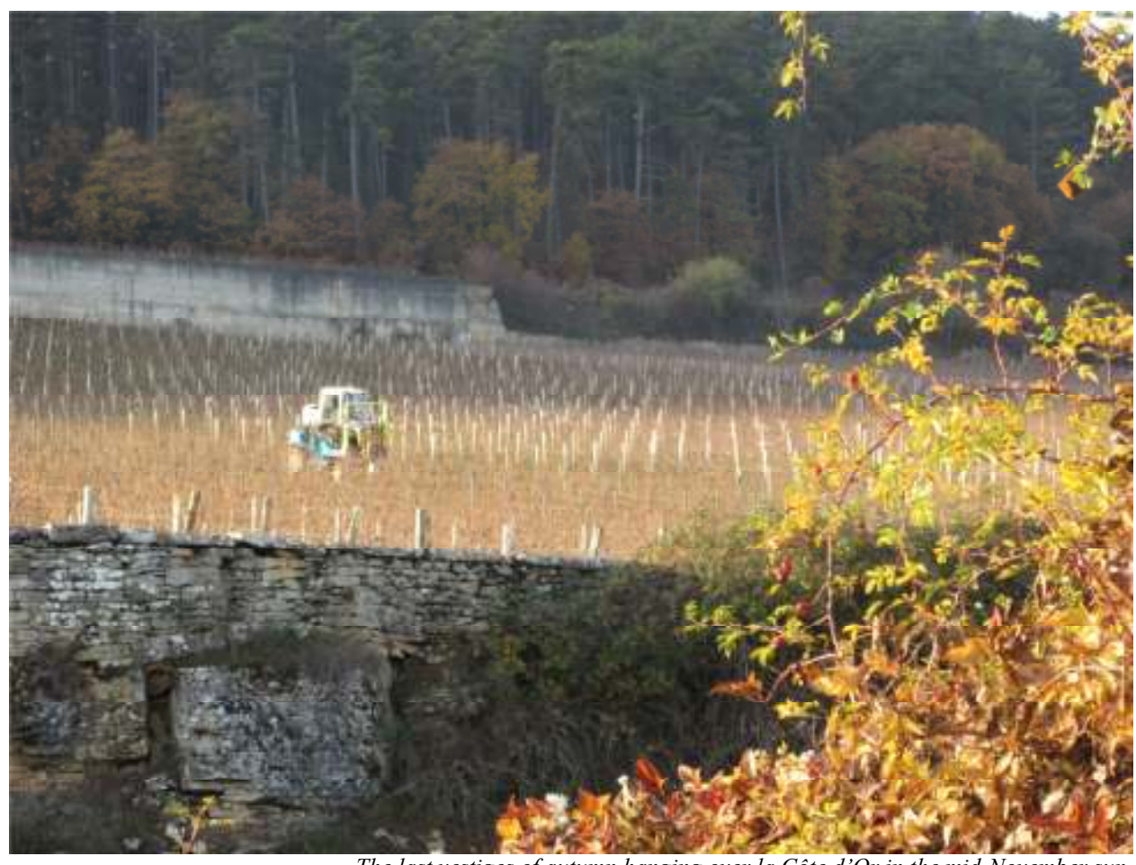
The last vestiges of autumn hanging over la Côte d'Or in the mid-November sun.