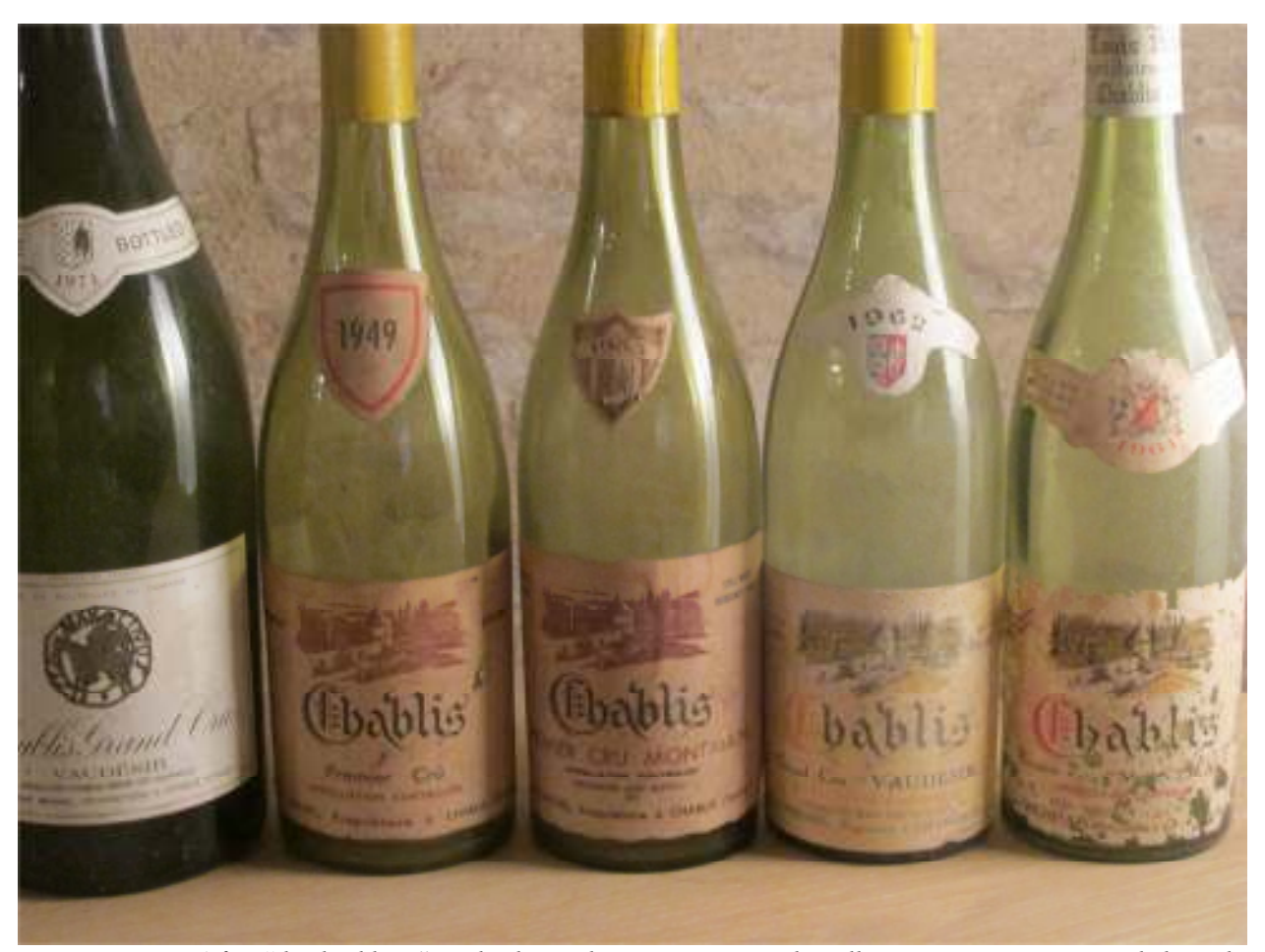
A few "dead soldiers" on display in the tasting room in the cellars at Domaine Louis Michel et Fils.

The 2016 Séchet from Domaine Michel is a racy and very refined premier cru, without quite the mid-palate amplitude of the last few premier crus, but excellent precision and intensity of flavor. The nose wafts from the glass in a vibrant blend of green apple, tangerine, chalky minerality, beeswax and a topnote of citrus zest. On the palate the wine is pure, full-bodied and snappy, with good, but not great depth at the core, racy acids and excellent focus and grip on the minerally and complex finish. Fine juice with a touch of ethereal that is fairly rare in this vintage. 2018-2040. 93.