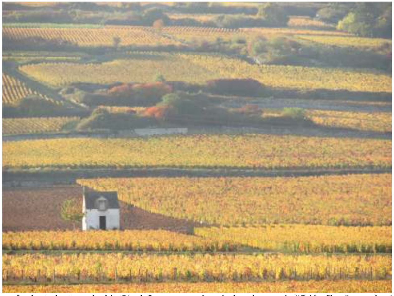
October in the vineyards of the Côte de Beaune- no need to ask where the name the "Golden Slope" comes from!

palate the wine is pure, full-bodied, racy and rock solid at the core, with fine cut and grip, great length and a very precise, energetic and promising finish. This will demand some time in the cellar to blossom, but will be outstanding in the fullness of time. 2022-2050+. 95.