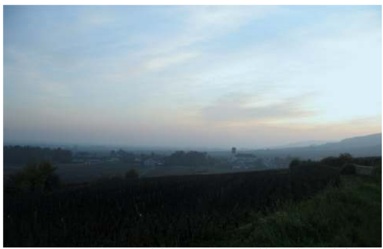
The late autumn sun starting to sink low over the vineyards of Pommard.

Despite the very low yields in Musigny this year, the Drouhin team has fashioned an absolute reference point bottling from this hallowed terroir in 2016. There is a sappy inner beauty there that is remarkable, but the wine will be every much defined by its great expression of soil and its classic structural chassis, and it is really a glorious synthesis of the three elements that makes this wine so special. The stunning bouquet is deep, pure and sappy, offering up scents of red and black cherries, raw cocoa, gamebird, lovely spice tones, a magical base of ironinfused soil tones, incipient notes of mustard seed and a suave base of nutty new oak. On the palate the wine is deep, full-bodied and plush on the attack, with a fine core, impeccable focus and balance, seamless tannins, outstanding focus and grip and a very, very long, poised and dancing finish. This wine included thirty percent whole clusters in 2016. Having been fortunate enough to drink many mature vintages of the Drouhin family's Musigny over the years, this seems likely to end up very much along the lines of the magical 1971 vintage of this wine. 2028-2090. 96.