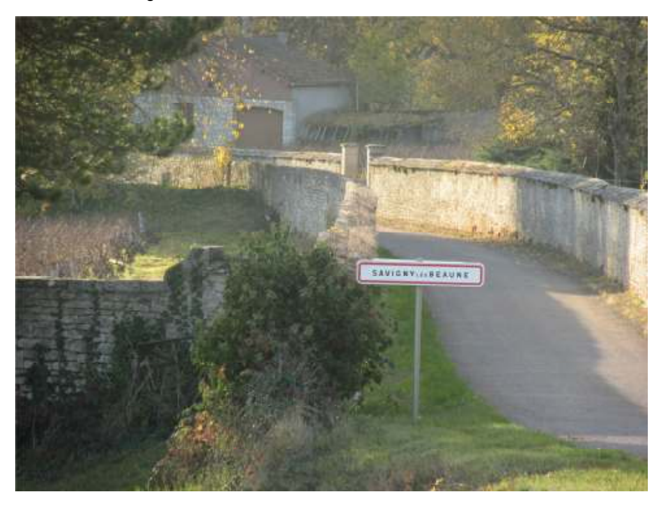
Savigny-lès-Beaune Domaine Simon Bize et Fils (Savigny-lès-Beaune)

likely to be a bit more muscular and broad-shouldered in 2016 than any of these other premier crus chez Gouges, and I am not sure it will be able to quite match the stunning precision of the Vaucrains in the long run. Time will tell. 2032-2080+. 94.